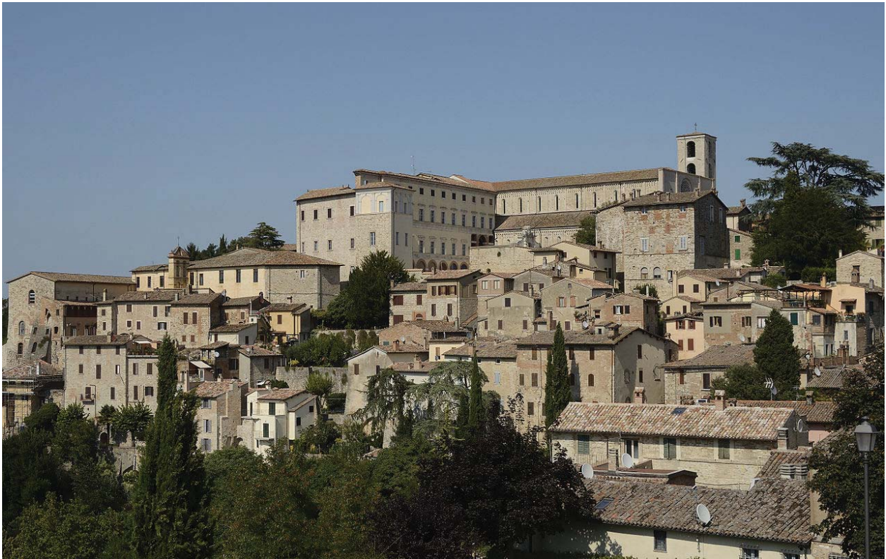
Todi (above) and its walls (below)

In January 1362 he was still captain in Volterra; on the 25 th of that month the Priors allowed him a brief absence; on June 21, he was elected War Captain in Todi.