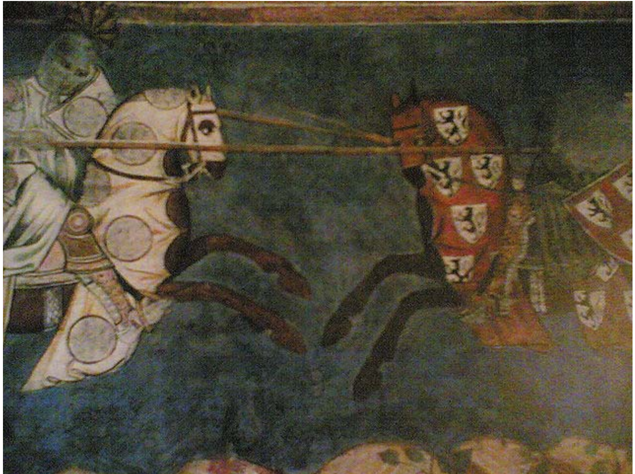
Middle Ages mercenary troops