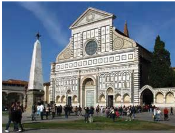
Basilica of Santa Maria Novella, Florence.