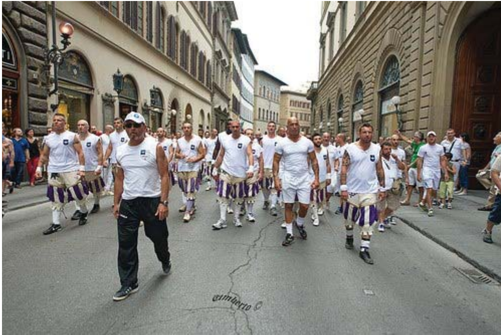
Historical Soccer Florentine game: Santo Spirito team- its color is white

The Guadagni Palace inherited from the Del Nero, in via de' Bardi, and now called Torrigiani Palace after our great-cousin Pietro Guadagni adopted the Torrigiani surname, is also in the Santo Spirito neighborhood. The Santo Spirito neighborhood color is white.