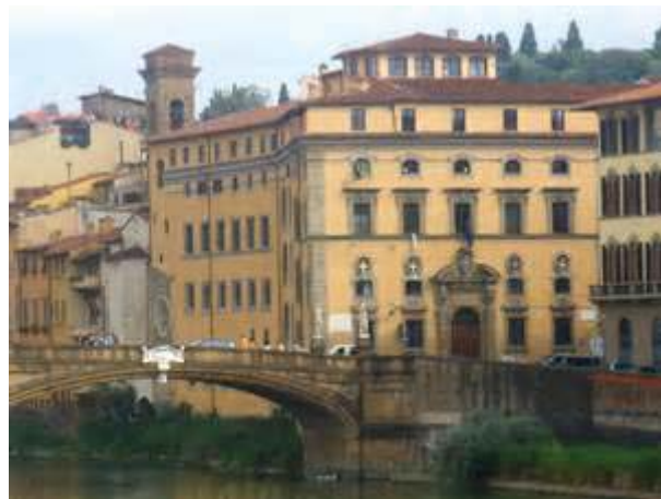
Another view of Frescobaldi Palace