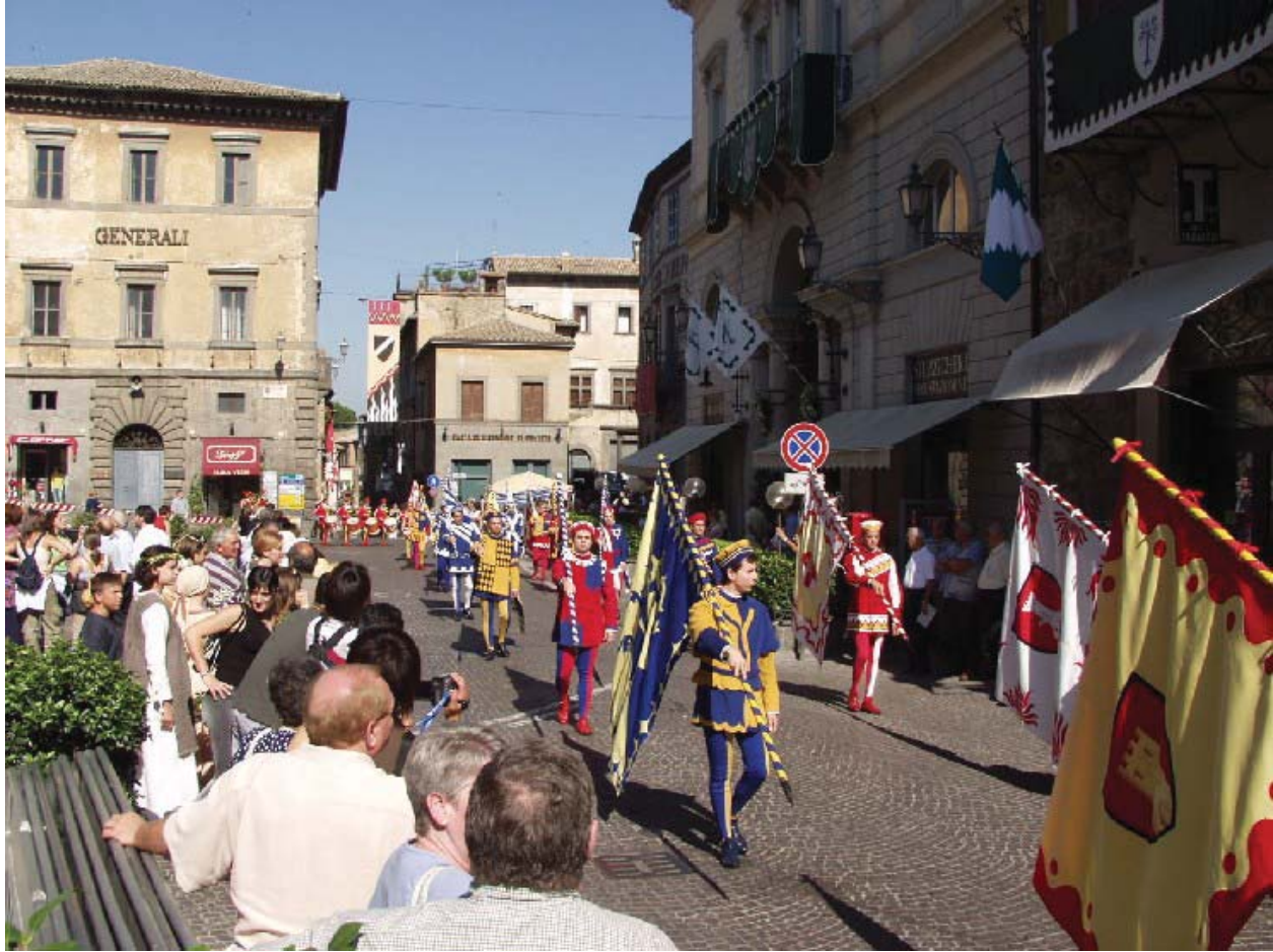
Historical Parade in Orvieto for the Procession of Corpus Domini

He was Prior again in May-June 1363 and, in the following July he was elected Captain of the People in Todi again. When his office expired after six months, he was reconfirmed for six more months. In January 1362 he presented himself in the scrutinies for the three major offices: from September 15, 1365, he was one of the twelve good men; from May 15, 1366, he was Mayor of Orvieto.