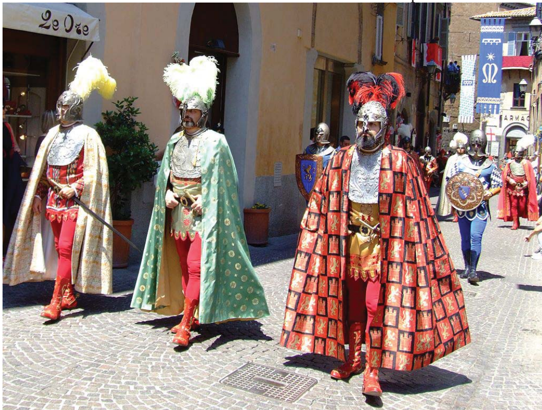
Orvieto: historical parade: three Knights, in the center is the Knight of the Counts of Marsciano.