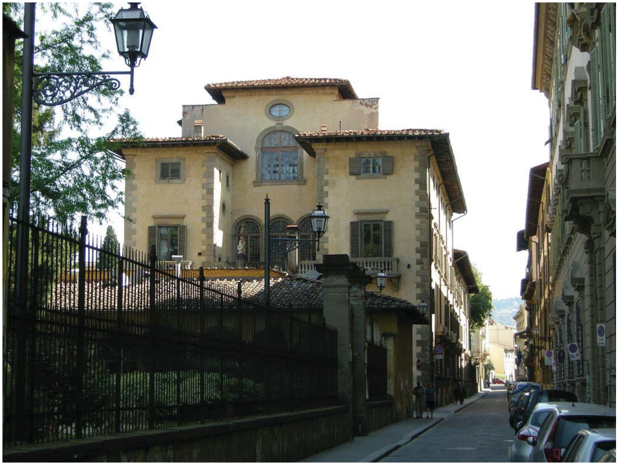
Guadagni "Nunziata" Palace