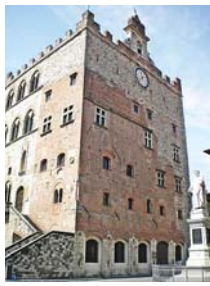
Prato – Palace of the magistrates

From June 15, 1355, he was one of the 12 good men, and from May 8, 1356 he was also one of the Gonfalonieri di compagnia (“Commanders of the People’s militia”).