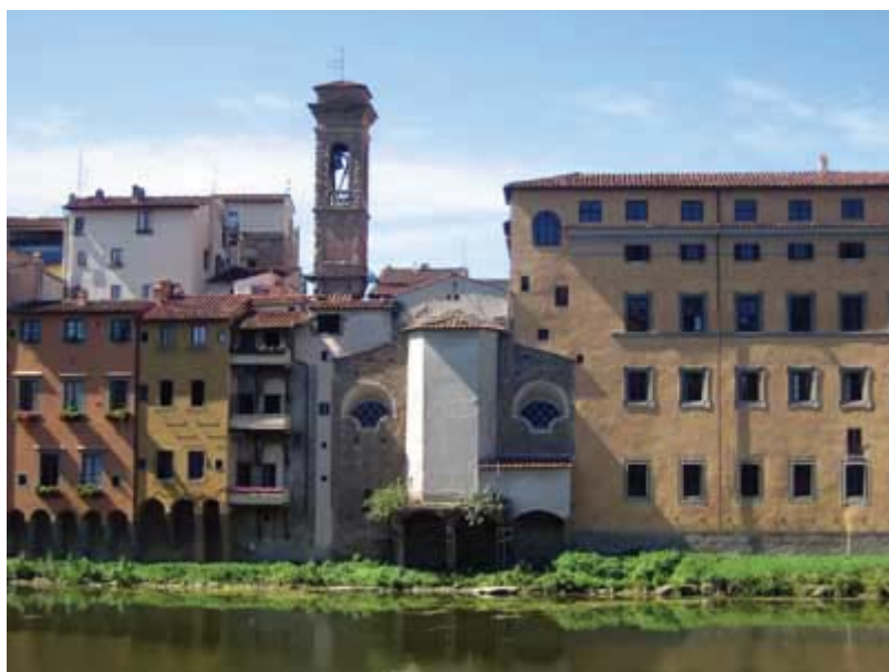
Frescobaldi Palace on the right, on the Arno River.