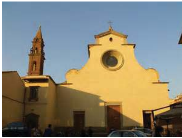
Basilica of Santo Spirito, Florence