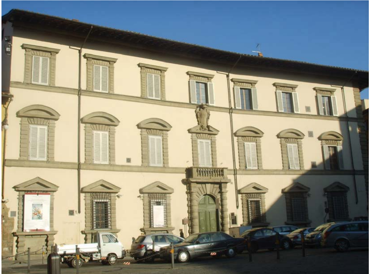
Guadagni dell'Opera Palace (Guadagni crest on top of central window)