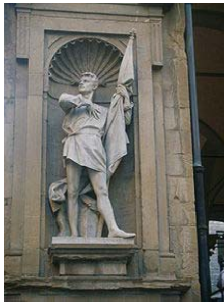
Statue of Michele di Lando, waving the ciompi banner, Florence.