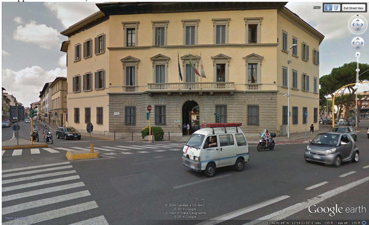
Close up of the left side of the Guadagni Palace on the right of the picture.