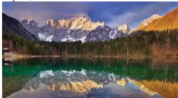
Friuli (Alps), Northern Italy