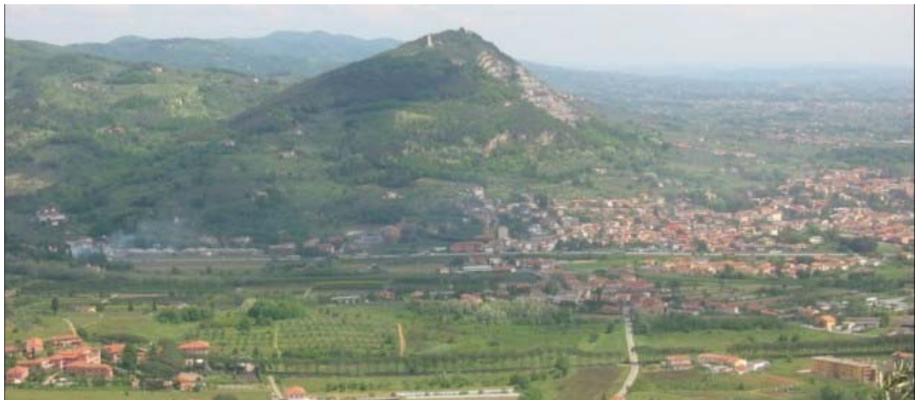
Val di Nievole (“Nievole Valley”)