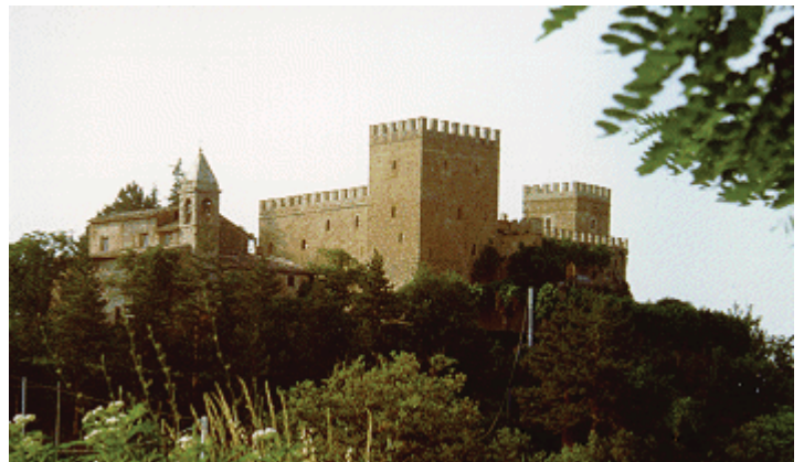
Castle of Camerino, of Rodolfo da Camerino