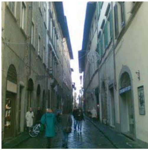
Borgo degli Albizzi (“Degli Albizzi Street”), Florence