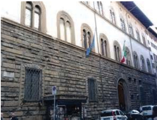
De' Pazzi Palace, Florence