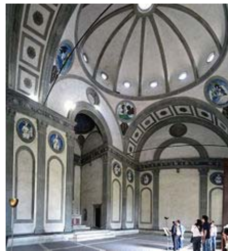
Pazzi Chapel by Brunelleschi (who also designed the "Duomo", Cathedral of Florence) in the Church of Santa Croce, Florence