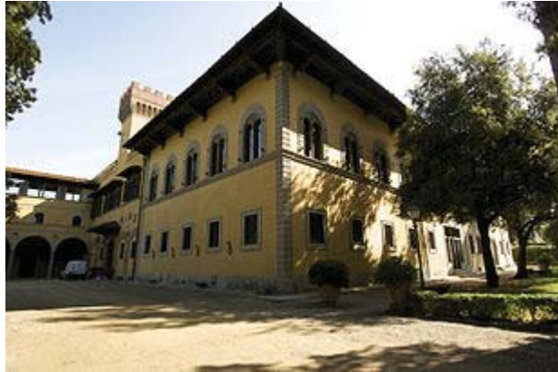
"La Loggia", De' Pazzi villa near Florence and Masseto.