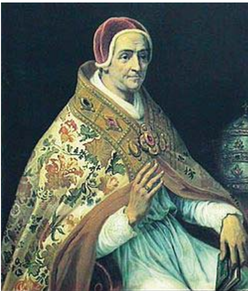
Cardinal Legate Roberto of Geneva