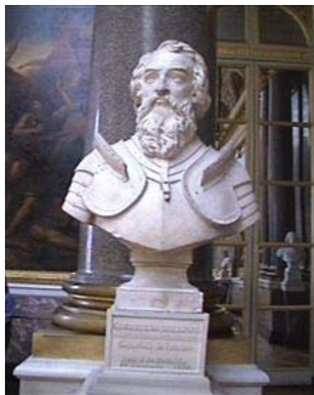
Gualtieri di Brienne, Duke of Athens