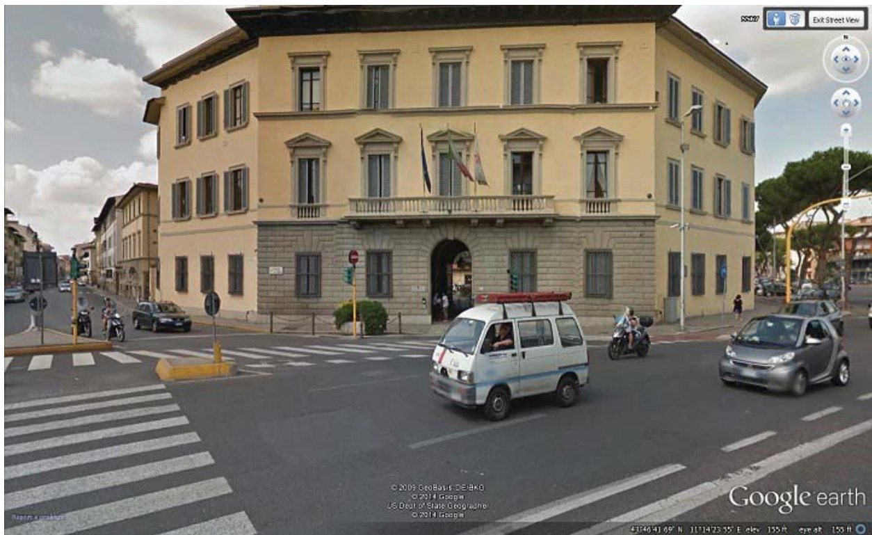
Guadagni Porta al Prato palace façade. The Palace has 17 windows per floor, without counting the windows in the back of it.

In the same year Migliore was given the government of Volterra, freed from the tyranny of Paolo Belforti.