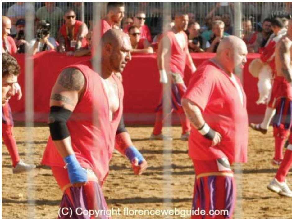
Historical Soccer Florentine game: Santa Maria Novella team- its color is red