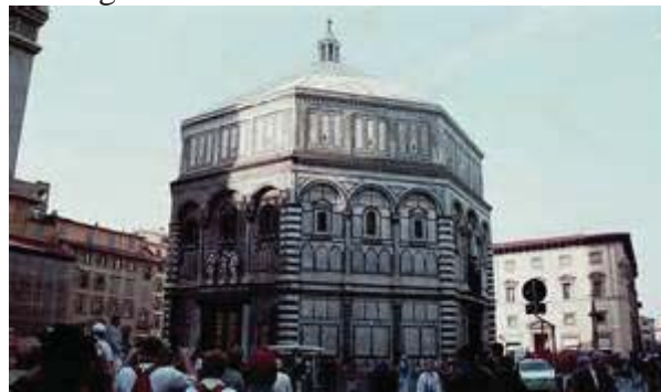
Baptistry of San Giovanni, Florence

Map of the four historical neighborhoods of Florence (the blue line is the Arno River): San Giovanni is the neighborhood where the Guadagni are originally from and the oldest in the city; its name comes from the Baptistery of San Giovanni, a very ancient church next to the Duomo; its color is green, its emblem the “Keys”. The Guadagni dell’Opera and the Guadagni Nunziata Palaces are in it.