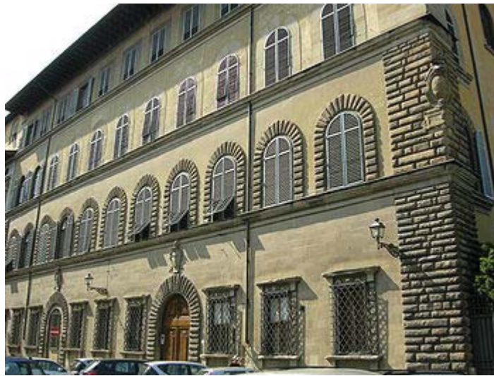
Guadagni del Nero Torrigiani Palace in via("street") de' Bardi