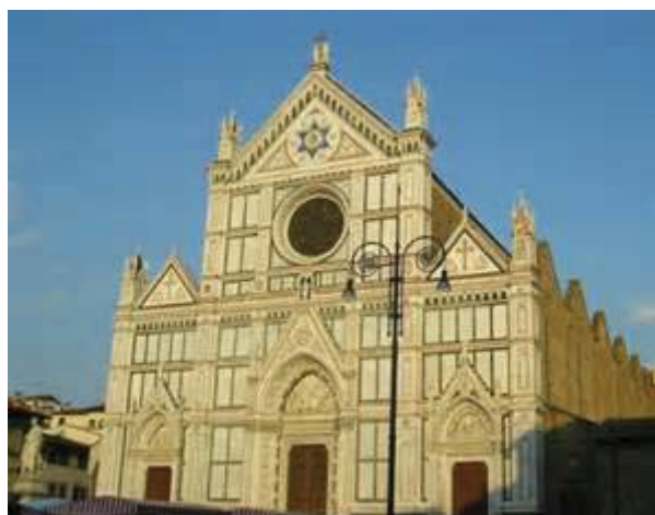
Basilica of Santa Croce (Florence).

The names of all guild members over thirty years old were put in eight leather bags called “borse” (“borsa”, singular, “borse” plural mean “bag(s)” in Italian). Every two months these bags were taken from the Church of Santa Croce, where they were ordinarily kept, and in a short ceremony drawn out at random. Only men who were not in debt (Rinaldo degli Albizzi paid Bernardo Guadagni’s debts so the latter could be elected “Gonfalonier of Justice” and arrest Cosimo de’Medici), had not served a recent term, and had no relation to the names of men already drawn, would be considered eligible for office.