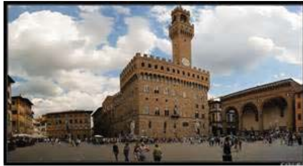
Palazzo Vecchio (“Old Palace”) in Piazza della Signoria (“Square of the Government”), Florence.

Immediately after they were elected, the nine were expected to move into the “Palazzo (“Palace”) della (“of the”) Signoria (“Government’),” aka “Palazzo Vecchio”, where they would remain for the two months of their office. They were paid a modest sum to cover their expenses and were provided with green-liveried servants. The Priori (“Priors”) had a uniform of crimson coats, lined with ermine and with ermine collars and cuffs.