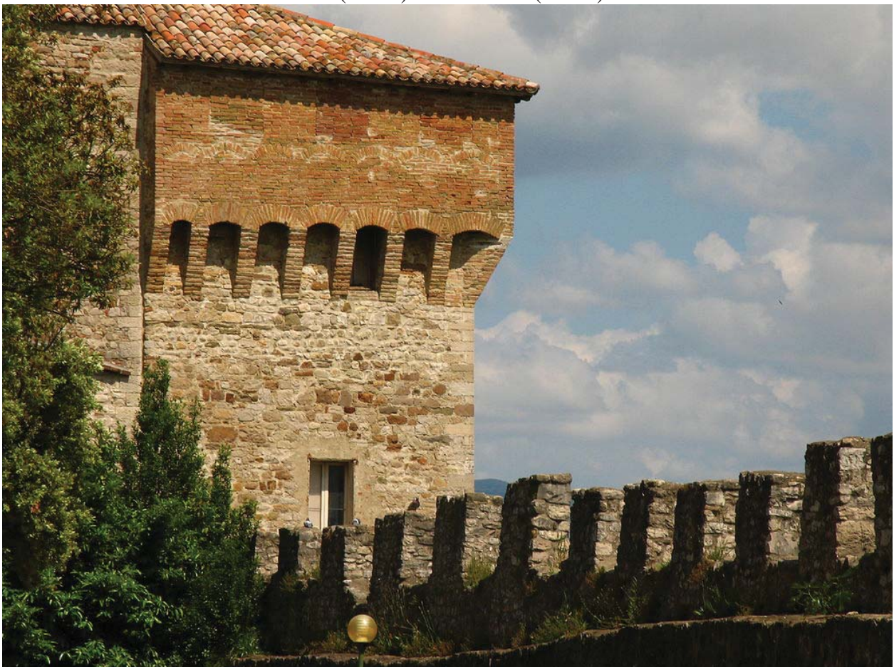
Walls of Todi.