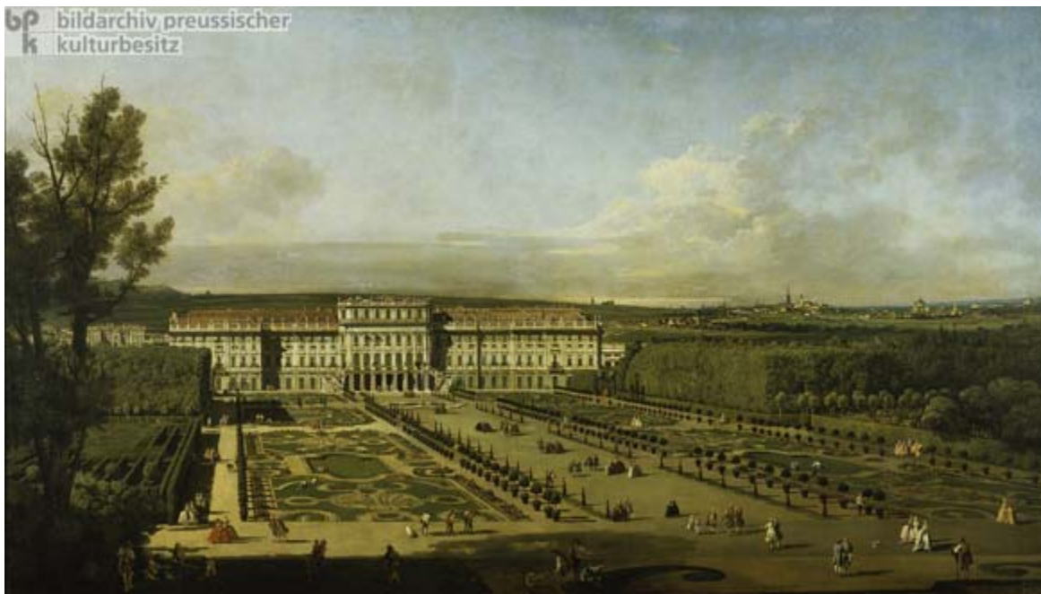
Imperial Palace of Schonbrunn, garden side. Oil on canvas by artist Bernardo Bellotto, 1759-1760