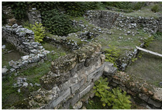
Ruins of ancient Thebes.

In 1460, Mehmed was informed by his Janissaries (Sultan's bodyguards) of a plot to place Franco