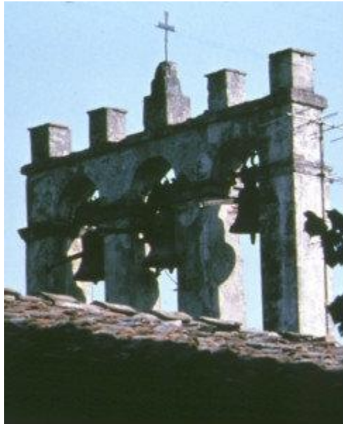
Bells of the Church of San Miniato a Pagnolle.