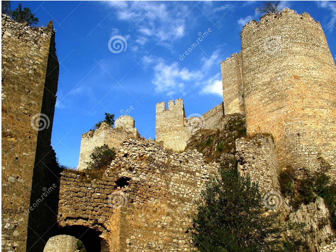
Old Fortress of Leghorn