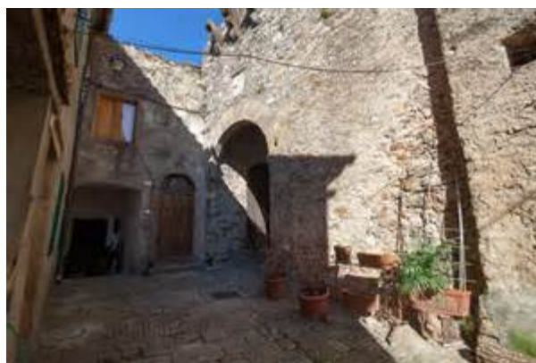
Door in the old walls of the town