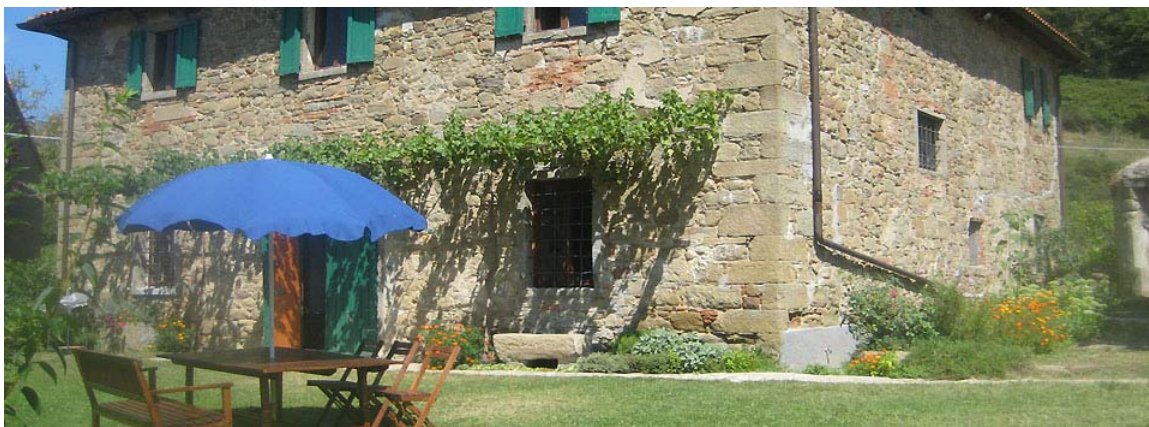
Guadagni Dufour Berte farm of San Leolino