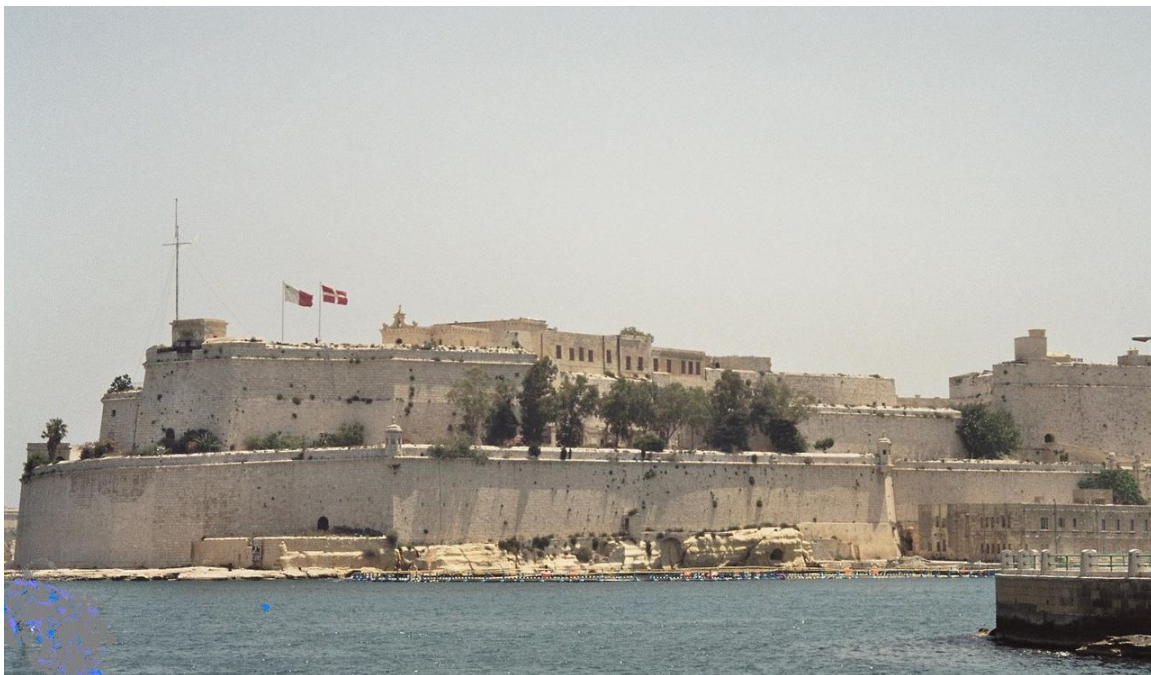
Fort of Saint Angelo in Malta of the Knights of Malta. The red flag with the white cross is the Flag of the Knightly Order of Malta to which many brave Guadagni Knights belonged during the centuries and to which, I think, the Guadagni can now belong by birthright if they choose to.