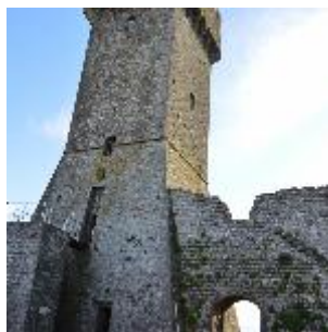
Fortress of Siena. (2 pictures above).