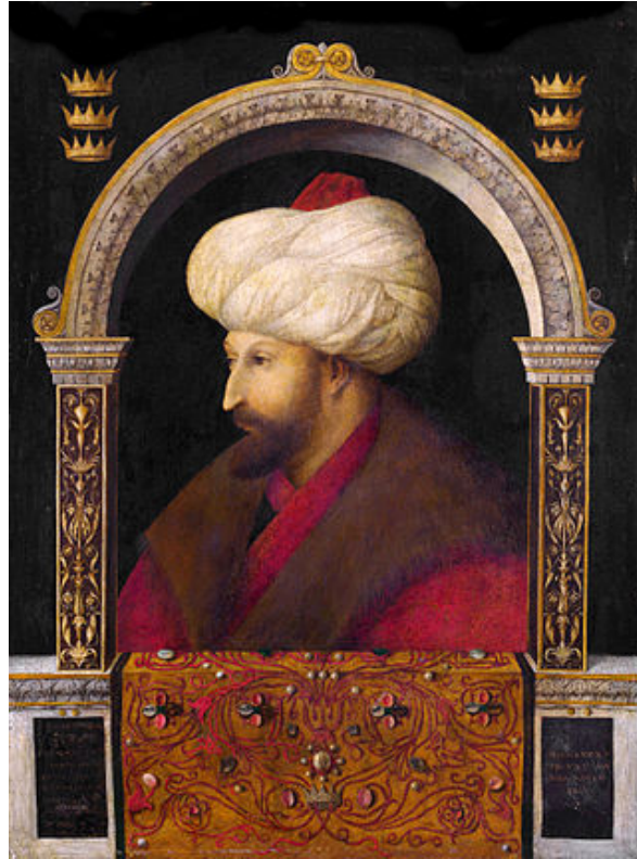
Mehmed II the Conqueror, Sultan of the Ottoman Empire (1432-1481)

(aka Turks) until June 1458, when they were forced to surrender.