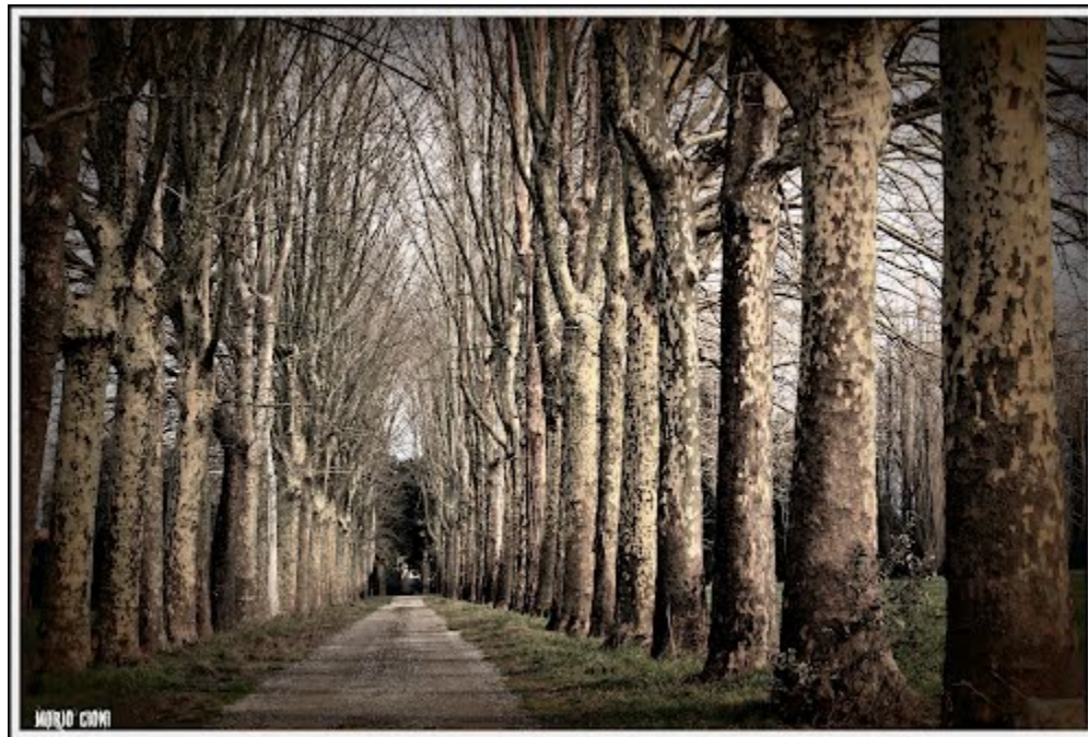
Tree lined alley to Montemurlo