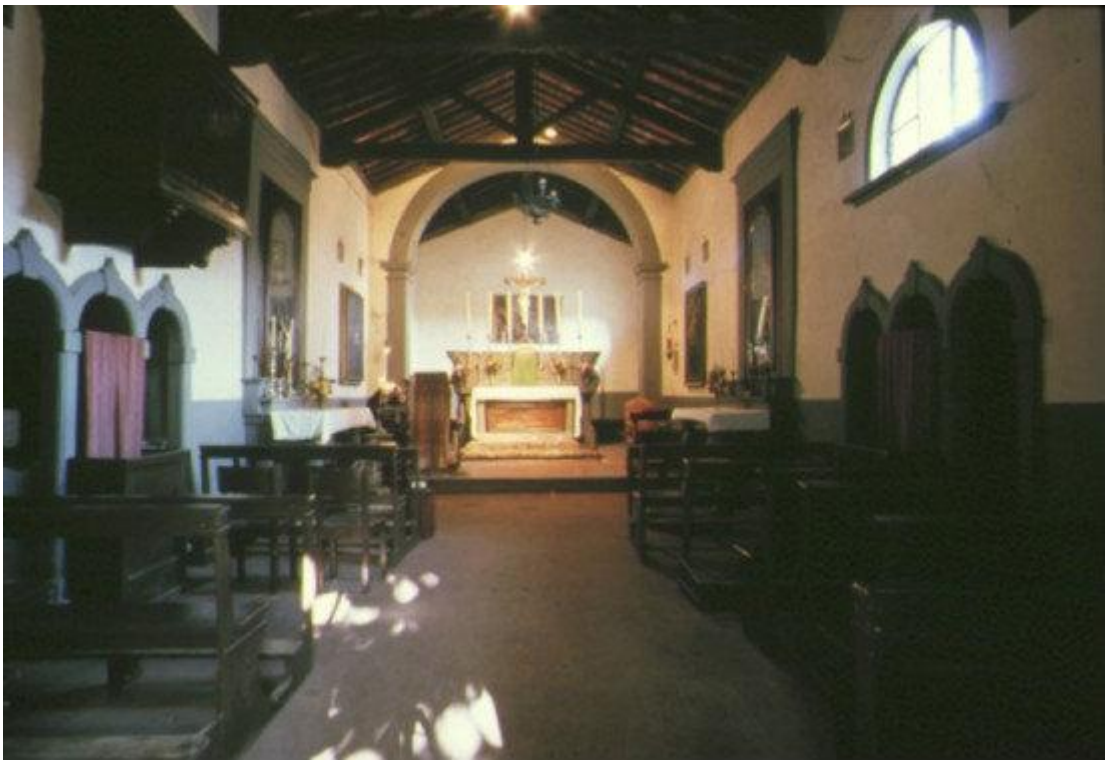
Inside of the Church of San Miniato a Pagnolle with the glass shrine containing Saint Faustina's body in front of the central altar of the church.