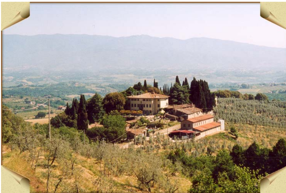
Guadagni Farm of Ruota, Bucine.