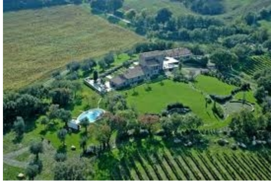
Farm of Montecchi seen from above.