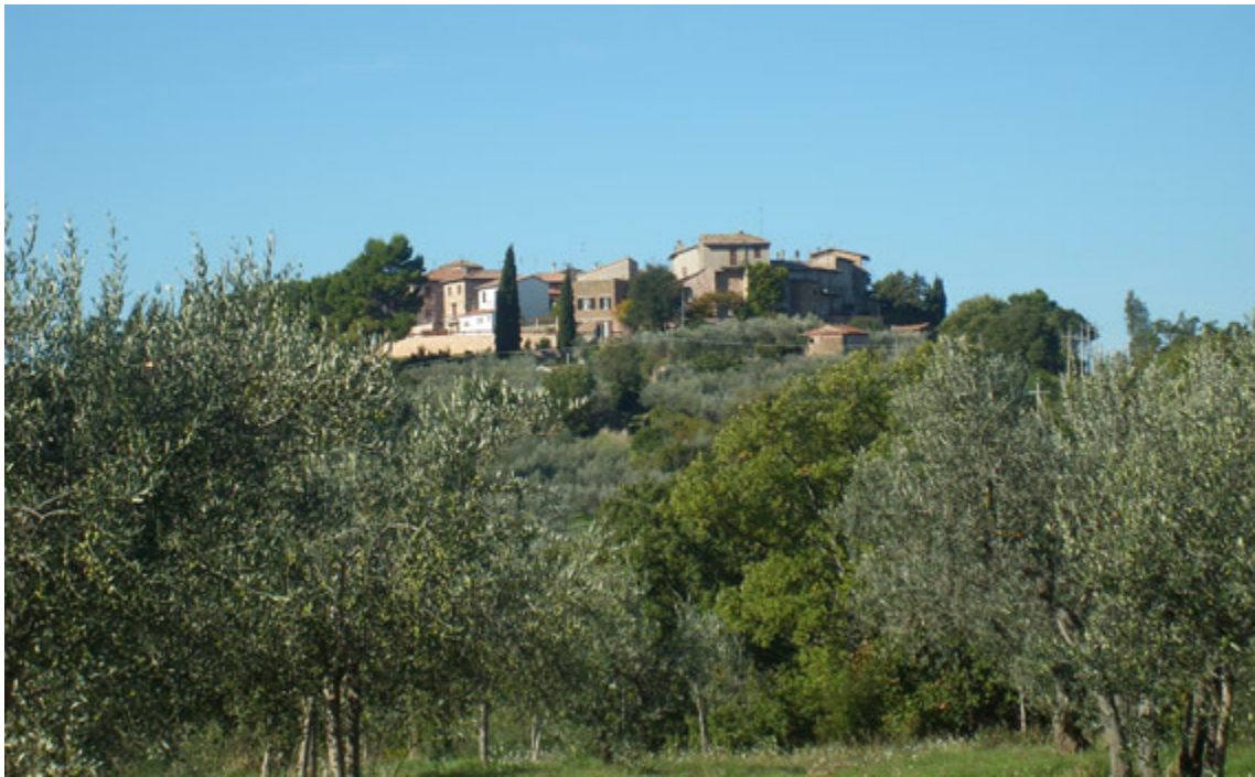
Montecchio aka Montecchi