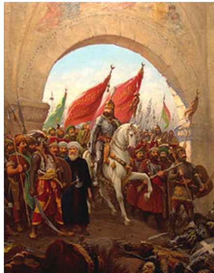
Mehmed II conquers Constantinople in 1453, at 21 years old.