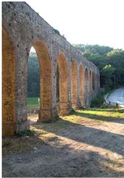
Ancient acqueduct, next to the farm of Parrana (Collesalveti)