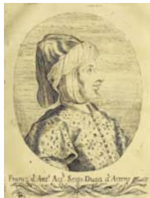
Francesco II Acciaiuoli

He only ruled for two years (1455-1456), when the Ottoman army under general Omer Bey arrived in Athens. The duke and his citizens hid themselves in the Acropolis and held out against the Ottomans