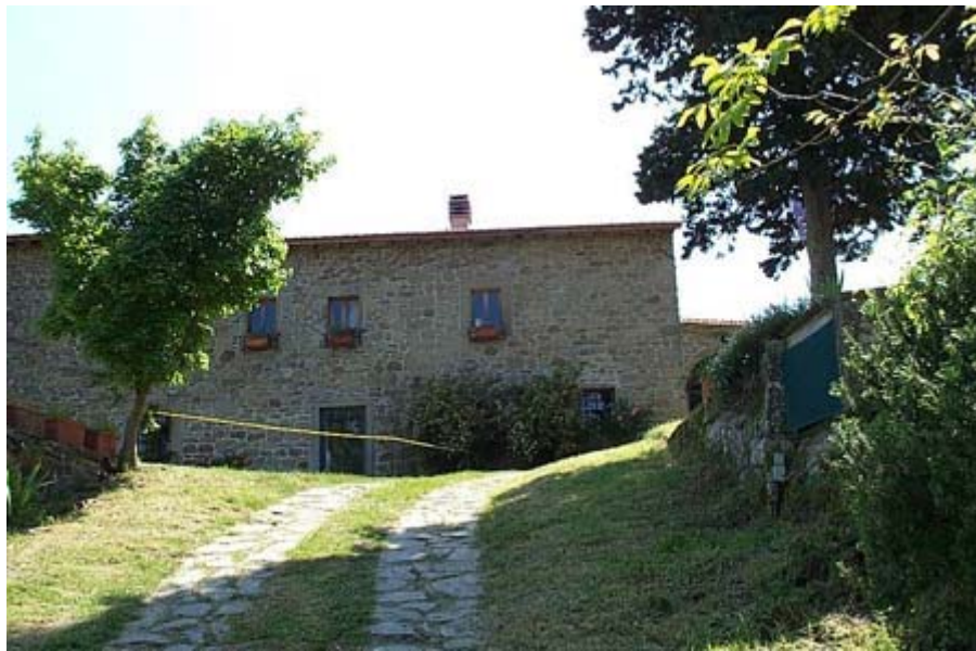
Road that takes to “La Gioconda”.