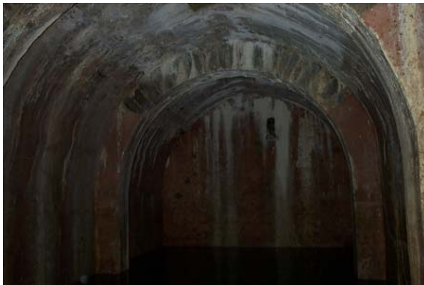
Dark view of the old cistern of the Guadagni Castle of San Leolino, where the rain water is gathered.