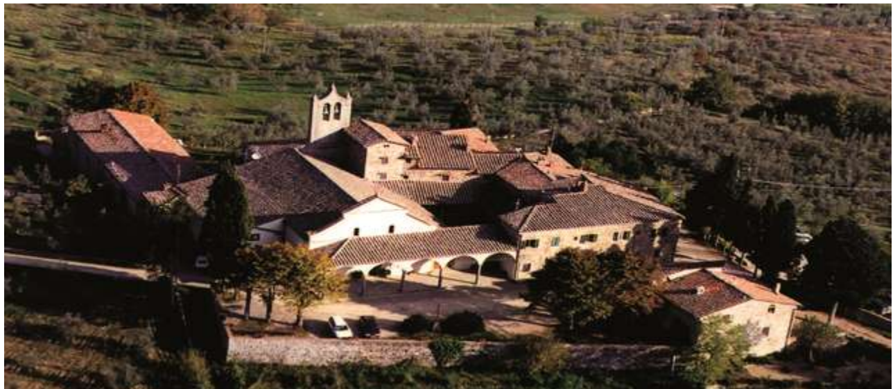
Pieve (“Country Church”) of San Leolino