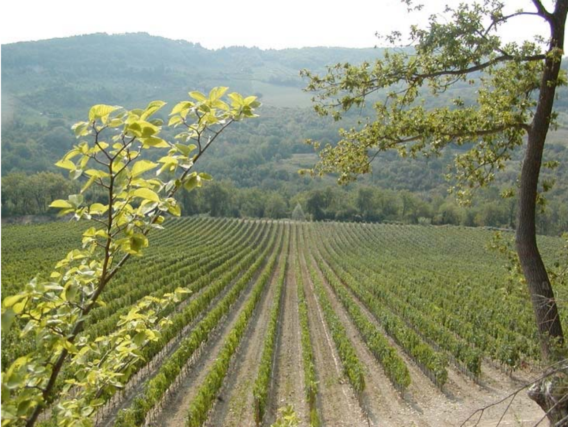
Farm of Montecchi, vineyards