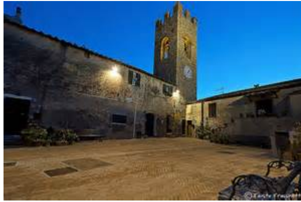
Montepescali – The Clock Tower at night.