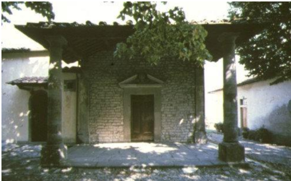
Facade of the Church of San Miniato a Pagnolle.

History of the Church of San Miniato a Pagnolle: The church of San Miniato a Pagnolle is mentioned in two Papal Bulls, one in the year 1102 by Pope Pasquale II and the other in 1134 by Pope Innocent II.