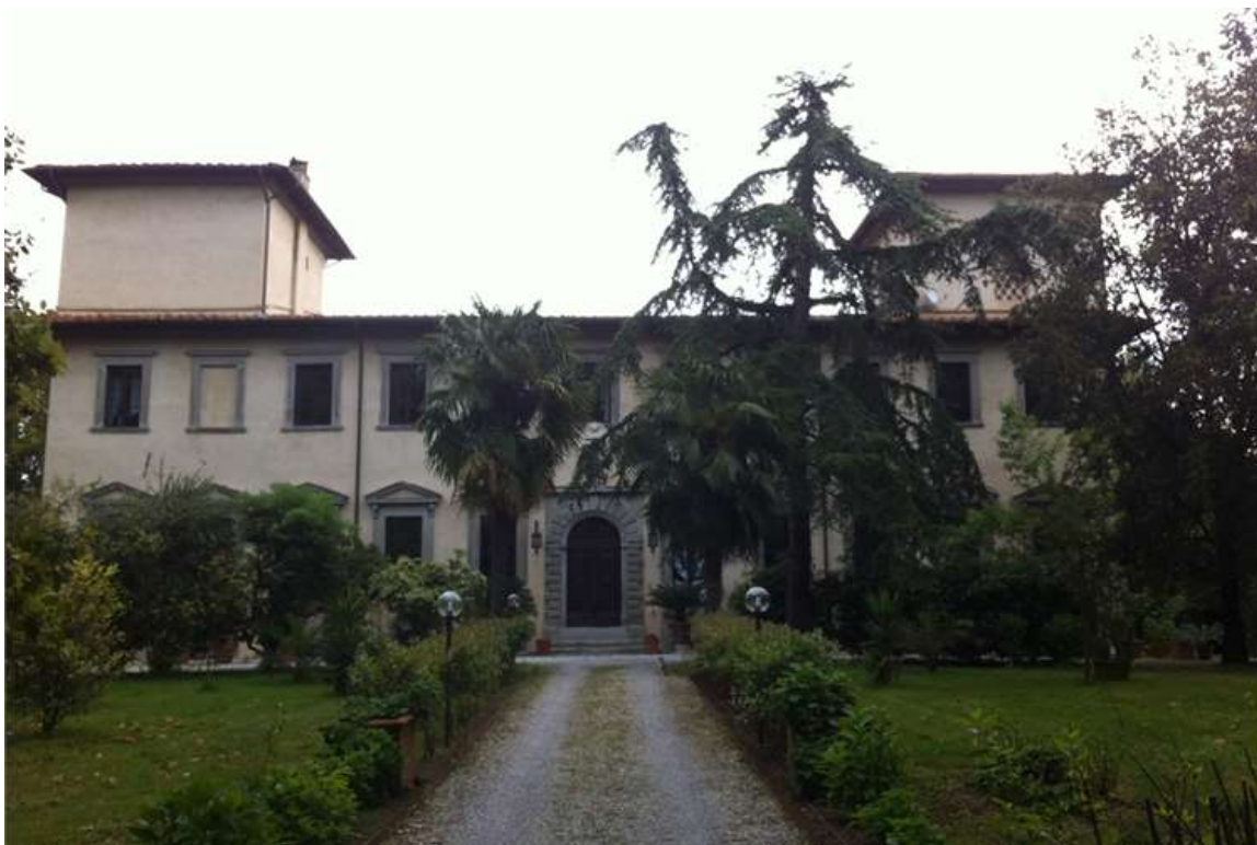
Arena, San Giuliano Terme, Pisa