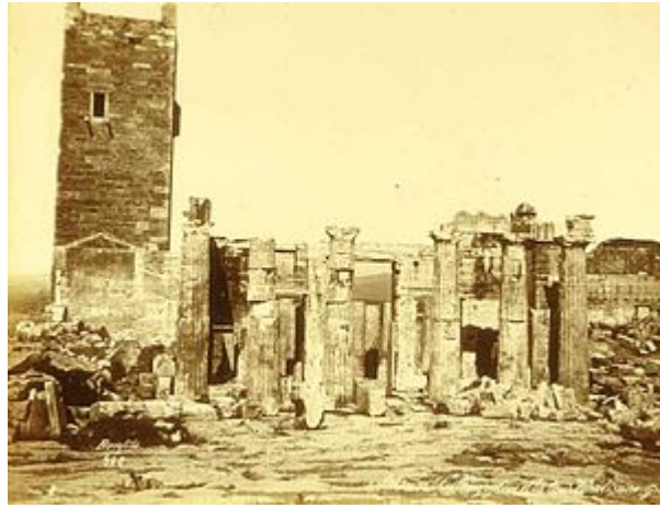
Acropolis of Athens with Crusader tower to protect it.