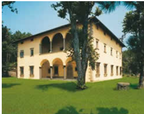
Le Fonti Guadagni Villa

Guadagni Villa of Le Fonti in the map, close to Fiesole on the left and Pontassieve on the right. It is now on sale on Internet. Touching the borders of the original property is the Church of San Miniato a Pagnolle, probably on the lower center right of the map, where the 17 century old body of Roman martyr Saint Faustina is kept. It was a gift of Cardinal Giovanni Antonio Guadagni to his family, the Guadagni of Santo Spirito (our branch). It is kept in a transparent glass alcove under the altar of the church for everyone to admire and venerate. It is and will always be owned by the Guadagni Family, who has also the patronage of the church. Miraculously the 17 centuries old body is preserved.