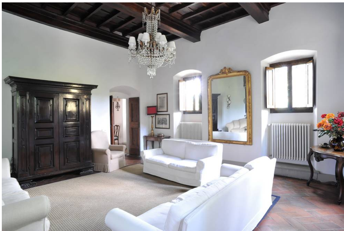
Sitting room in Masseto

It also contains balances, annotations, bills and receipts of the years 1849-1853: a 1872-1873 year notebook; annotations and bills of the years 1836, 1839, 1846, 1882.