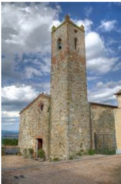
Church of San Niccolo' in Montepescali