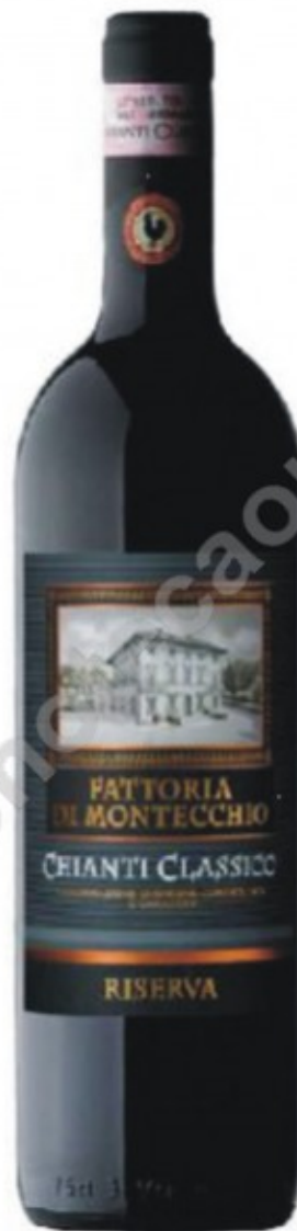
Farm of Montecchi (aka Montecchio): Chianti Classico.