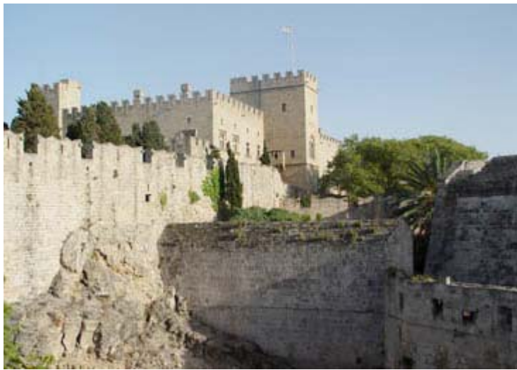
Castle of the Knights Hospitallers of Jerusalem in the Island of Rhodes (Eastern Mediterranean).