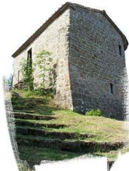
“La Torre” (“The Tower”), it used to be a tower of the Guadagni castle of San Leolino. Part of the old walls can still be seen.