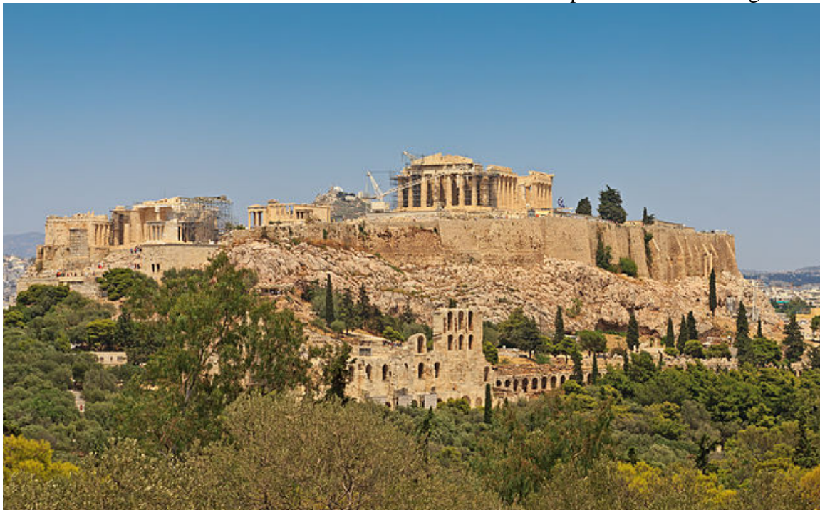
Acropolis of Athens

He only ruled for two years (1455-1456), when the Ottoman army under general Omer Bey arrived in Athens. The duke and his citizens hid themselves in the Acropolis and held out against the Ottomans