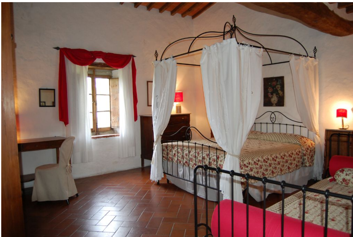
Bedroom in the San Leolino farmhouse