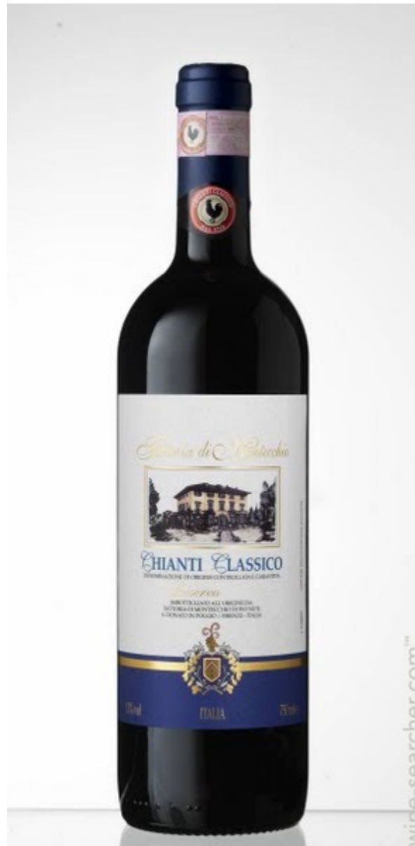
Farm of Montecchi Chianti Classico Riserva DOCG.

The Guadagni Family Farm of Montecchi was located in the heart of the most historically ancient zone of the Florentine Chianti Classico.