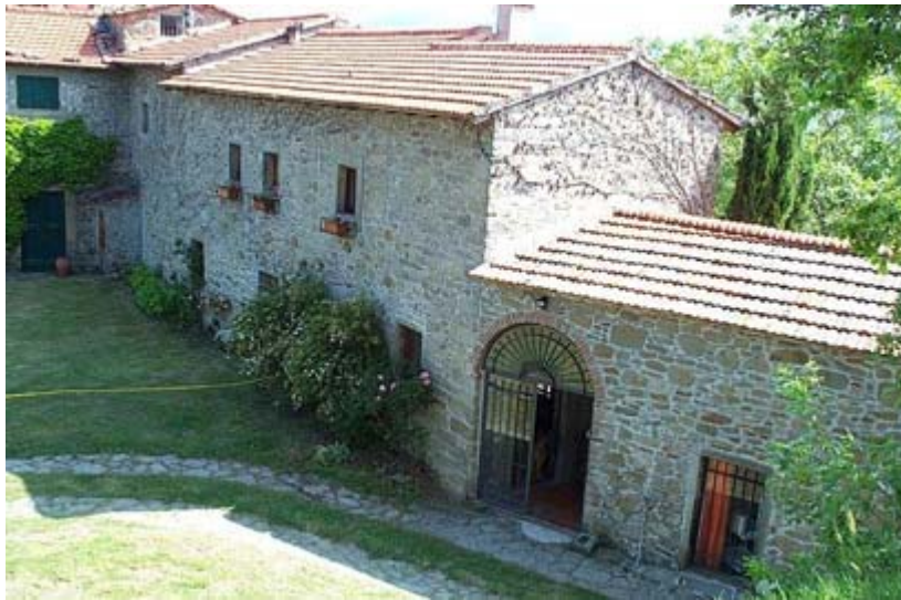
Other view of “La Gioconda.”

“La Gioconda , house in the San Leolino Guadagni Estate, built on the old prisons of the Guadagni Castle, which can still be visited.