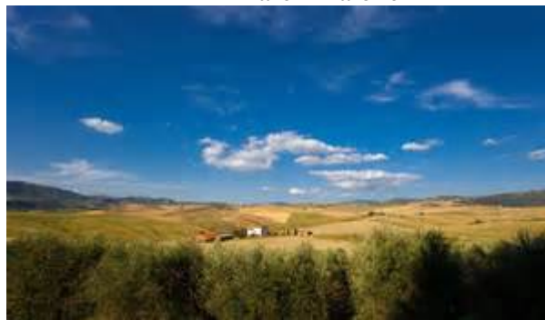
Maremma: “Italy’s Far West”