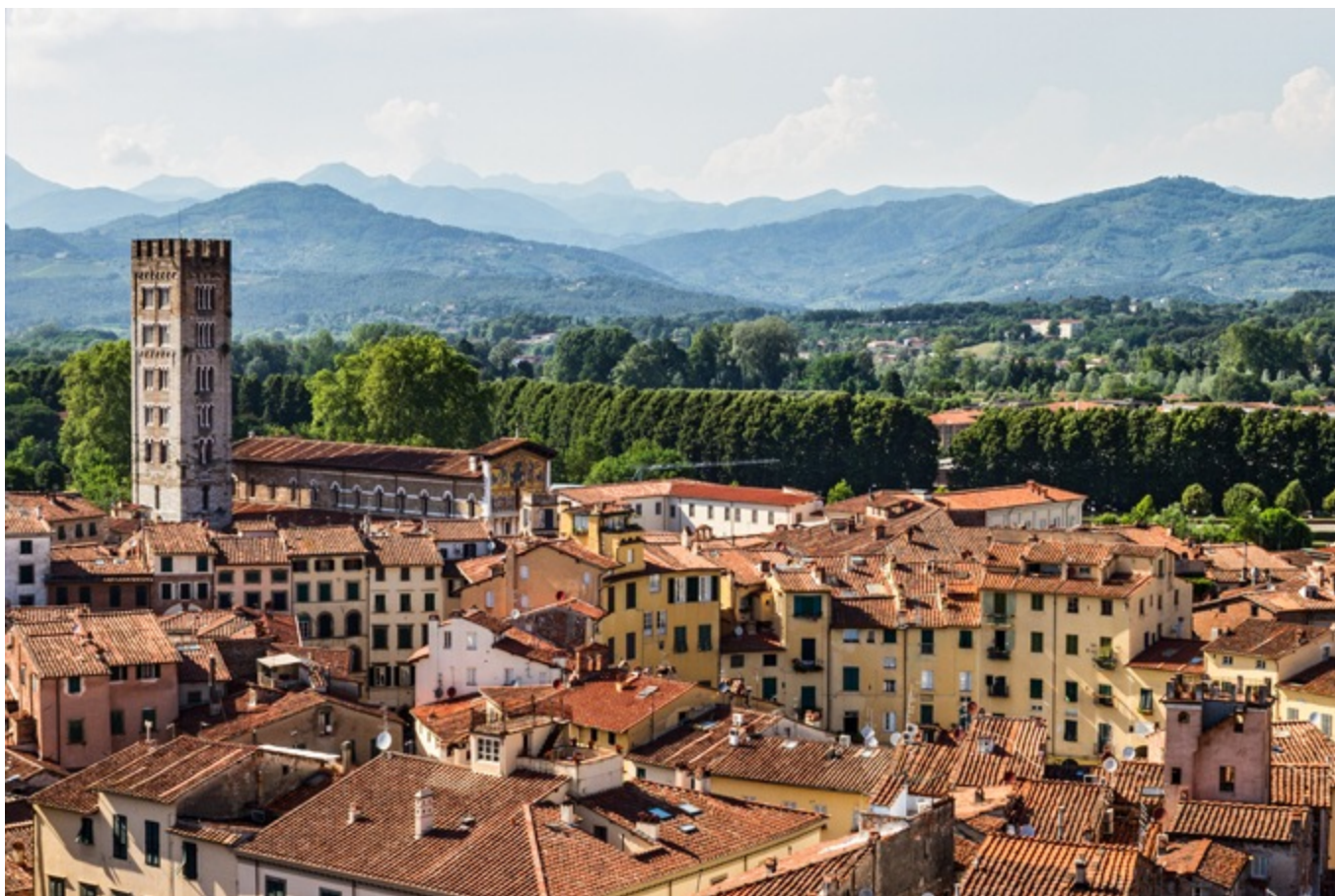
San Giuliano Terme – Pisa