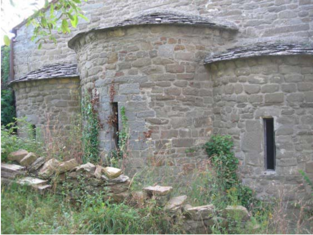
Restoration of the church of San Leolino