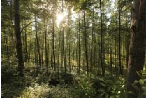
Views above and below of farmhouses and woods of the Marquisate of San Leolino del Conte