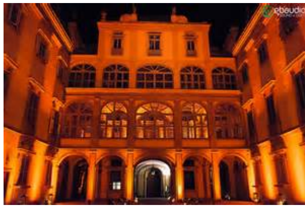
Inside courtyard of the Corsini Palace by night (above) and during the day (below),