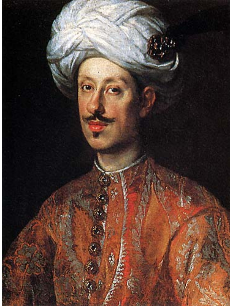
Ferdinando II de' Medici Grand Duke of Tuscany (1610-1670)