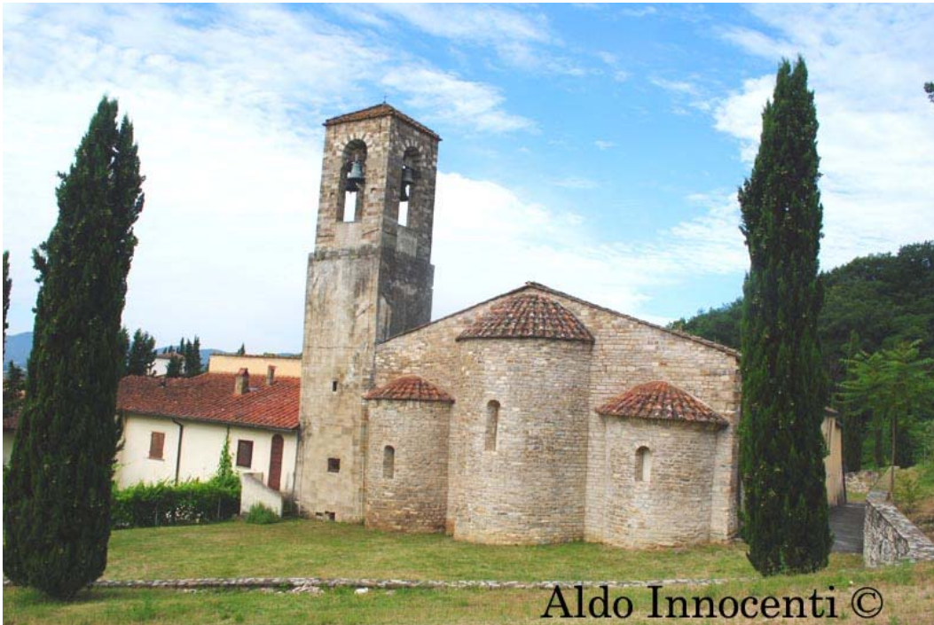
Aldo Innocenti ©