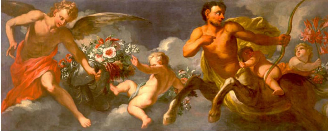
Pier Dandini (1646-1712) spring time

Below are a few selected views of the inside of the Corsini Palace, some of its artistic treasures and shows. It is still privately owned by our cousins.