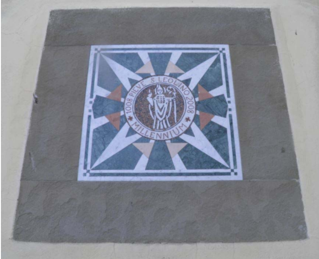
Stone image of Saint Leolino The church was 1,000 years old in 2008. It is the oldest church in the Province of Florence.