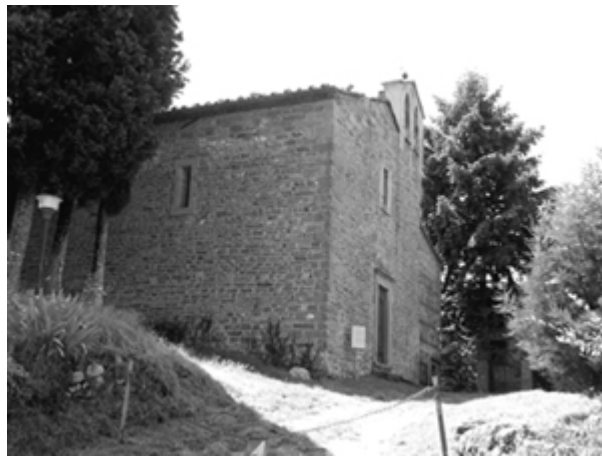
Church of San Leolino