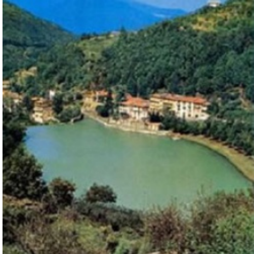
Town of Londa on the Londa River