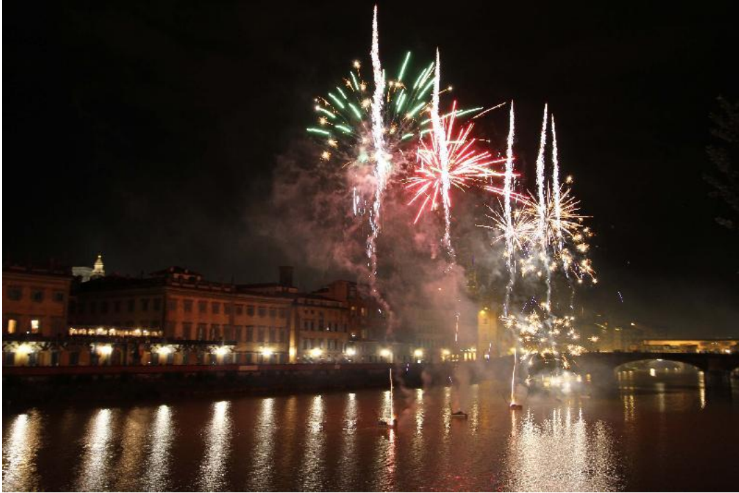
Fireworks from Corsini Palace