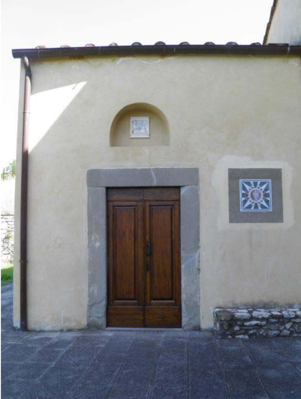
Door of San Leolino Church with image of the Saint on the wall on the right