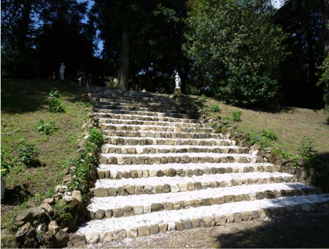
Large staircase leading from the villa to the park.