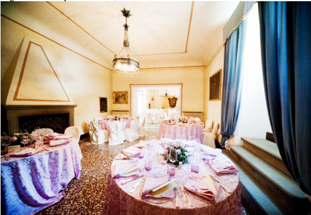
Dining room of the villa, now a hotel, with the Guadagni and Dufour Berte family crests on the wall at the end of the room.