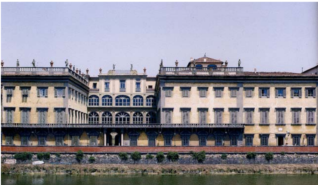
Corsini Palace on Lungarno Corsini, Florence.