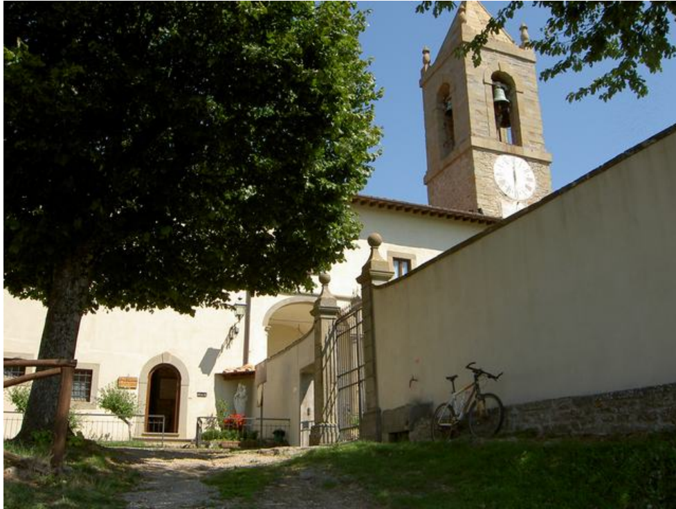
Sanctuary of La Madonna del Sasso, Fiesole