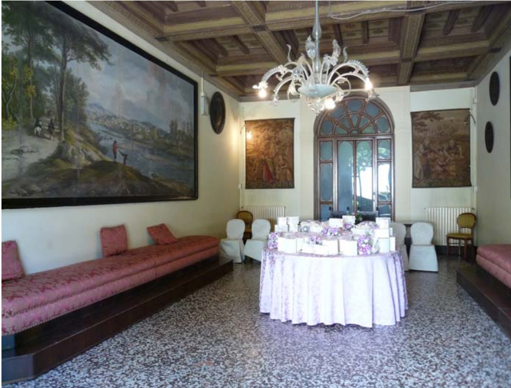
Main entrance of the villa.