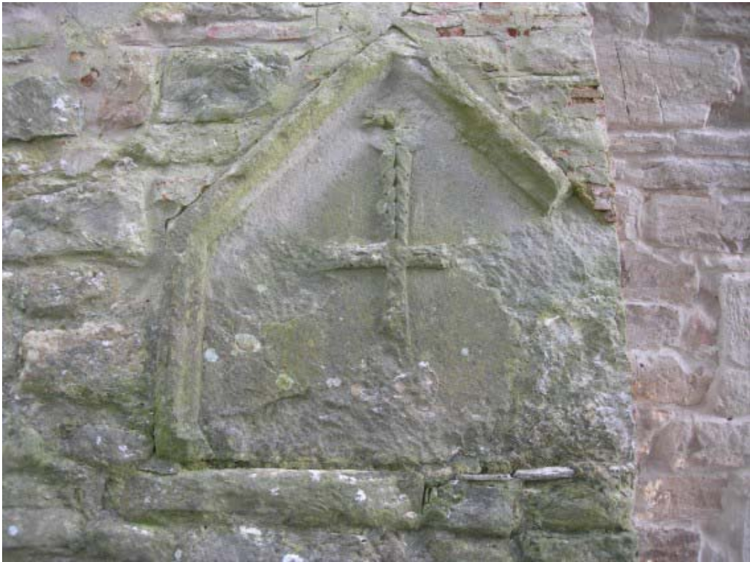
Absides of Church of San Leolino