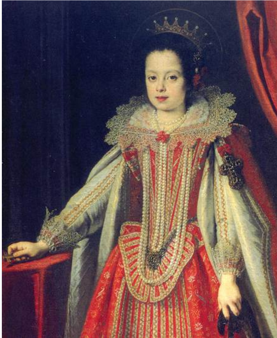
Vittoria della Rovere (1622-1694)

was 17. They named him Cosimo de' Medici, Grand Prince of Tuscany, but he only lived two days. A year later they had another son, but he died "unnamed". Maybe he only lived a few hours.