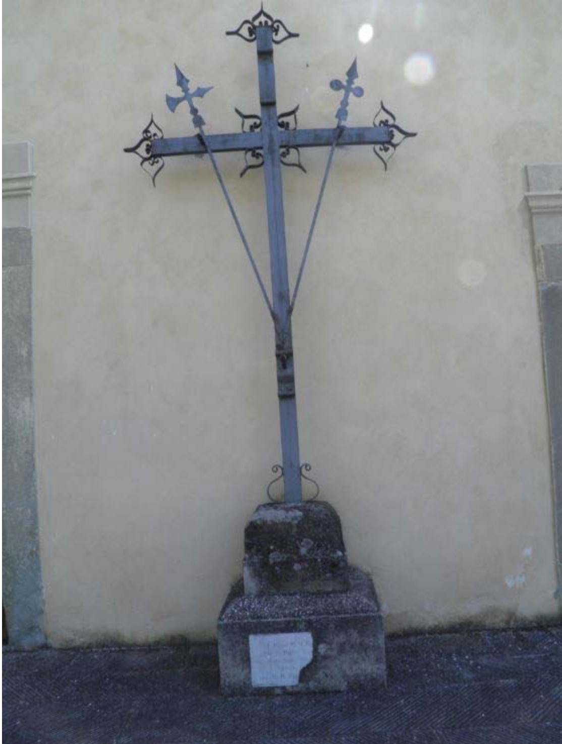
Crucifix 1006 years old in front of the Church of San Leolino, built in the year 1008.