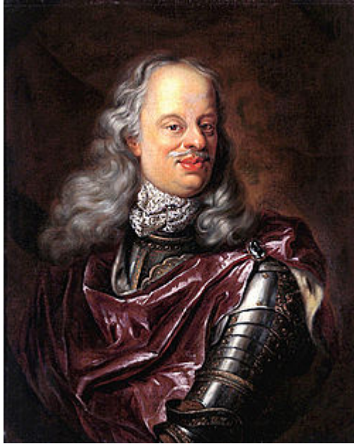
Cosimo III de' Medici Grand duke of Tuscany (1642-1723)