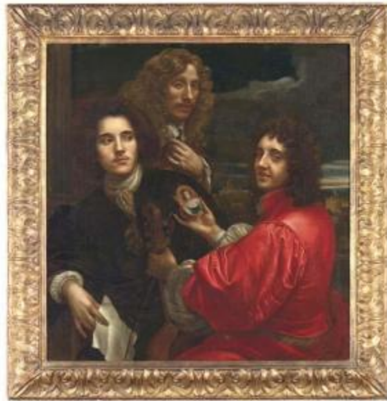
Anton Domenico Gabbiani (1652-1726); Group portrait of three gentlemen- (self-portrait).

The construction continued non-stop for 50 years. The magnificent decorations, that were done between 1692 and 1700, belong to one of the finest and most intense moments of Florentine painting. The outstanding painters include Anton Domenico Gabbiani, Alessandro Gherardini and Pier Dandini.