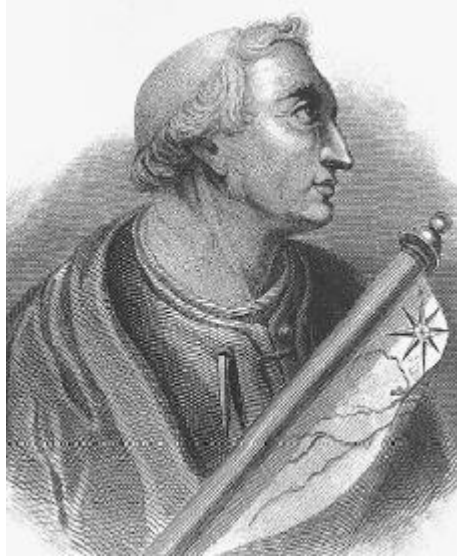
Amerigo Vespucci (1454-1512)