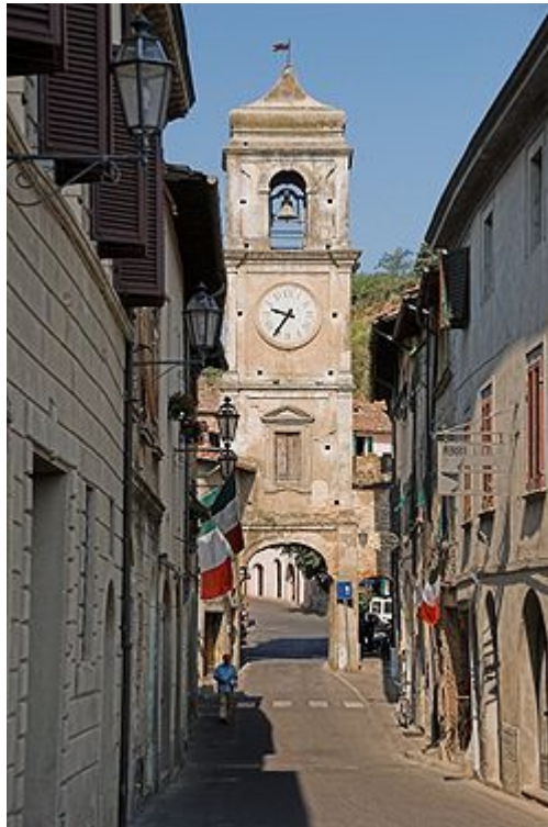
Palaia – Civic Tower