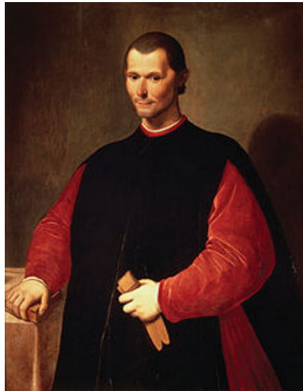
Niccolò Machiavelli (1469-1527)