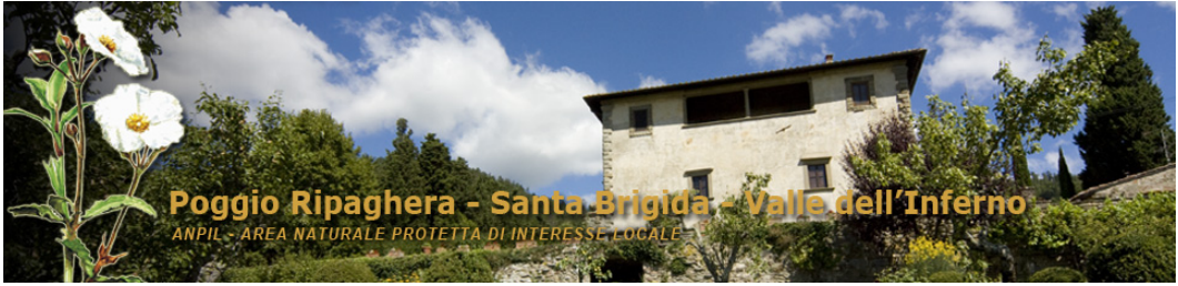
Guadagni Garden of Santa Brigida, Pontassieve