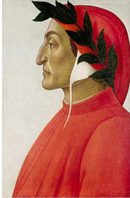
Dante Alighieri (1265-1321)