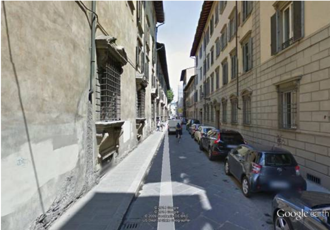
“Nunziata Guadagni Palace” side on Gino Capponi Street (left of the picture; Capponi Palace on the right).

...kept by me Michel'angelo Morelli; it will be used to keep track of all the daily expenses for the service of the Guadagni Household behind the Santissima Annunziata.