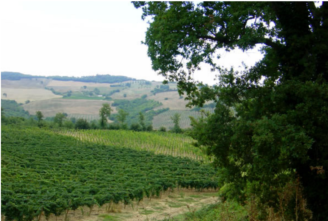
Vineyards of Porrona