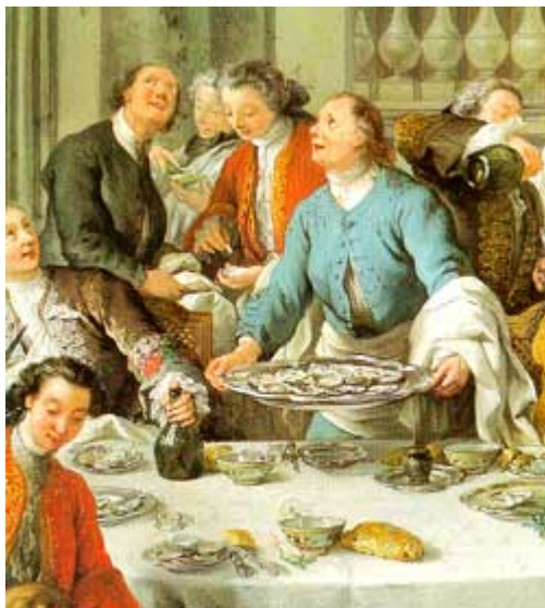
18 th Century food.