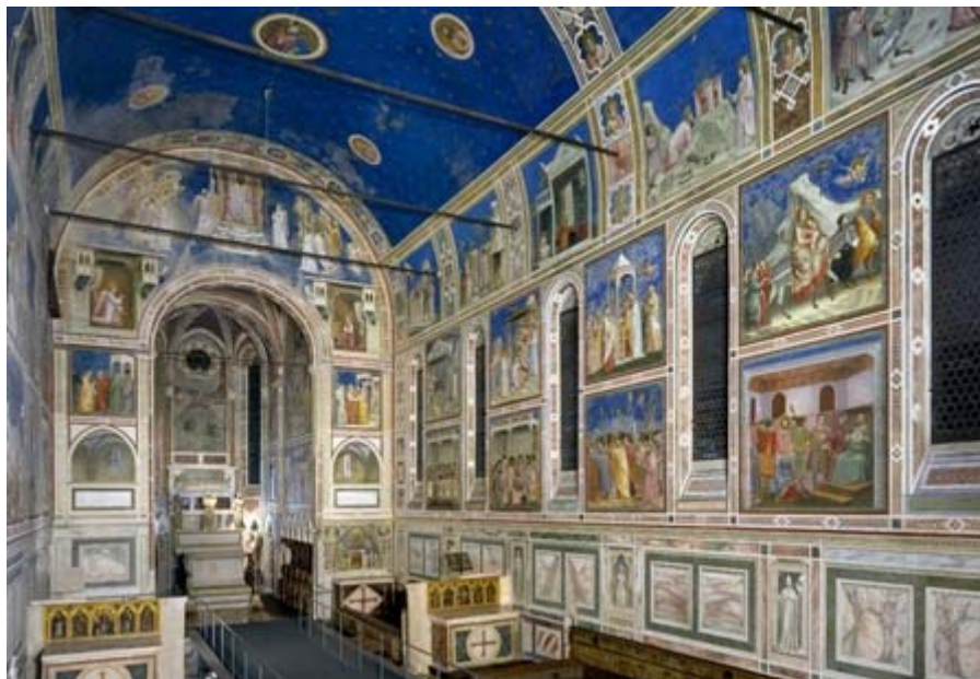
Scrovegni Chapel by Giotto as a whole.

Famous art historian and artist Vasari (1511-1574), drawing on a description by poet Boccaccio, who was a friend of Giotto, says of him that “there was no uglier man in the city of Florence” and indicates that his children were also plain in appearance. There is a story that when Dante was visiting Giotto painting in the Scrovegni Chapel, and seeing the artist’s children underfoot, he asked how a man who painted such beautiful pictures could create such plain children. To this Giotto, who according to Vasari was always a wit, replied “I made them in the dark.”