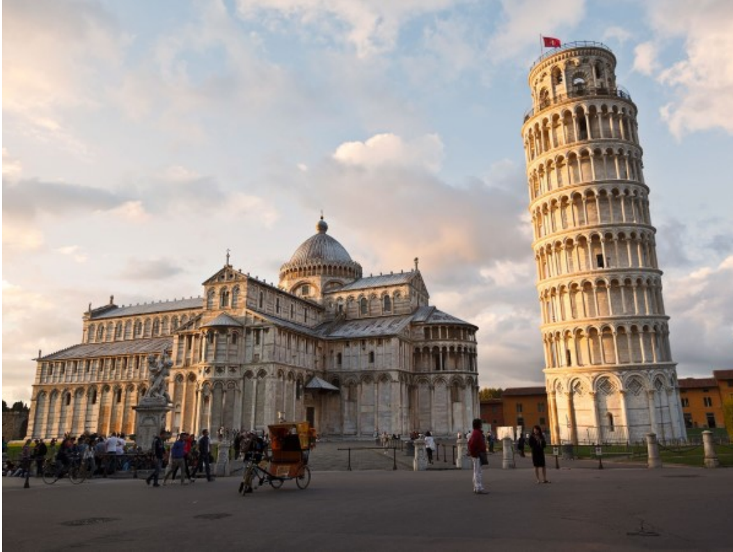
Pisa: Cathedral and leaning tower.