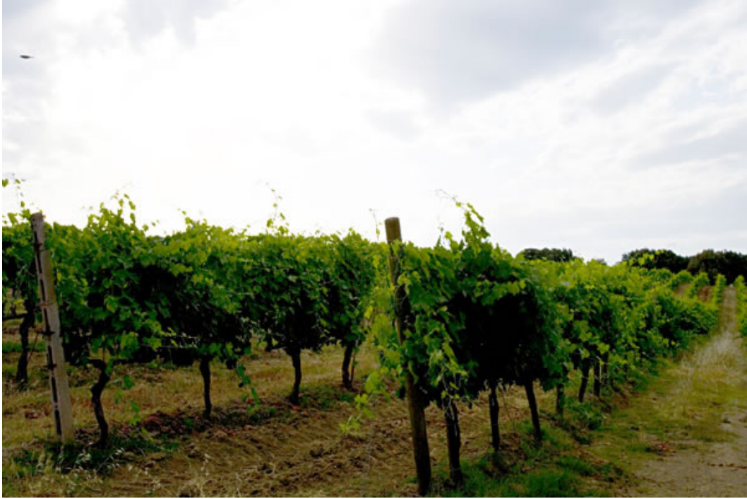
Vineyards of Porrone