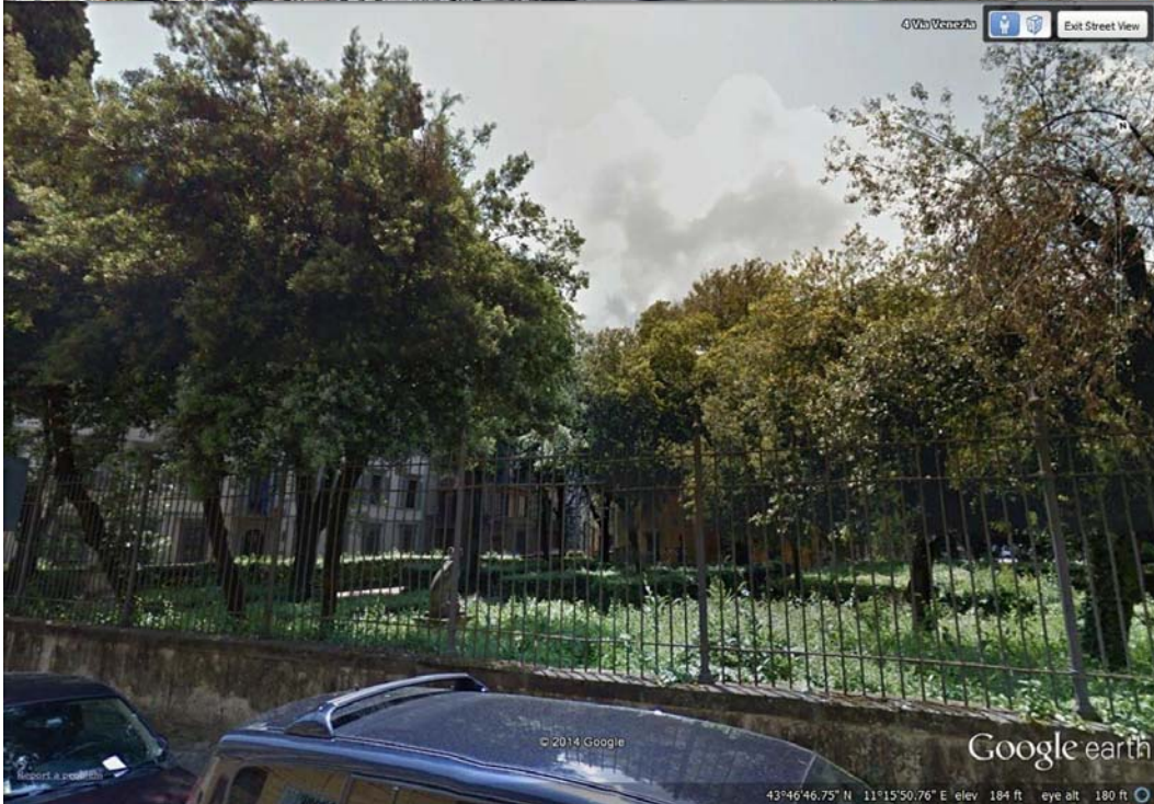
Guadagni Garden of the “Nunziata” Palace in Florence. (3 pictures above).