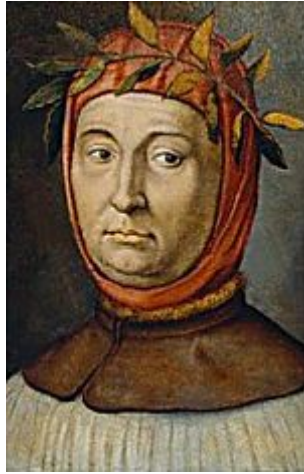
Francesco Petrarca (1303-1374)