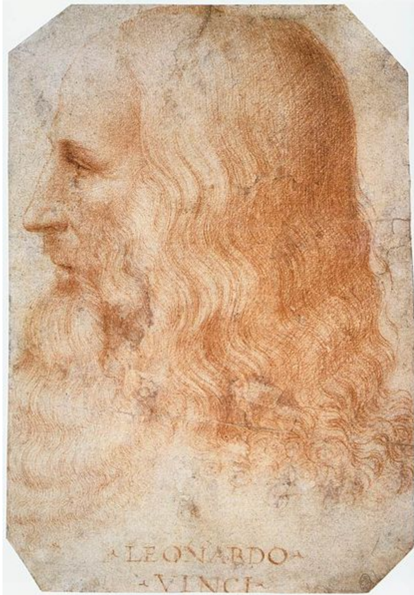
Leonardo da Vinci (1452-1519)