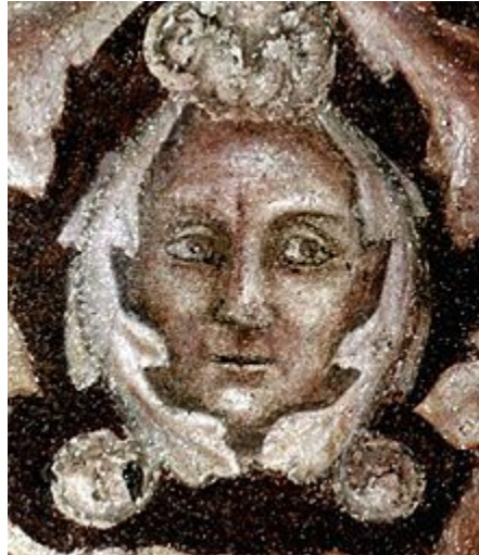
Portrait of Giotto (1266-1337) in the Peruzzi Chapel

Famous art historian and artist Vasari (1511-1574), drawing on a description by poet Boccaccio, who was a friend of Giotto, says of him that “there was no uglier man in the city of Florence” and indicates that his children were also plain in appearance. There is a story that when Dante was visiting Giotto painting in the Scrovegni Chapel, and seeing the artist’s children underfoot, he asked how a man who painted such beautiful pictures could create such plain children. To this Giotto, who according to Vasari was always a wit, replied “I made them in the dark.”