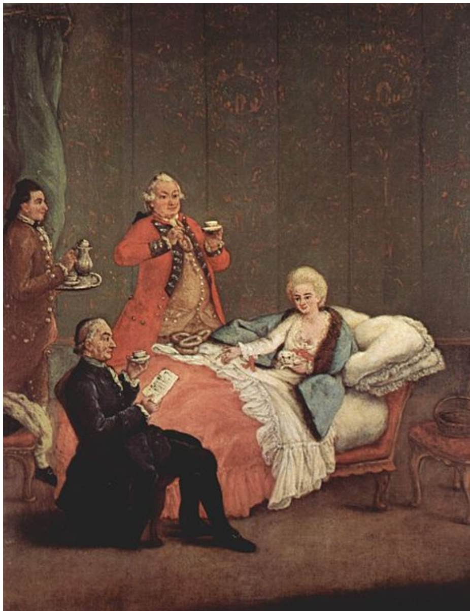
The “morning chocolate” by Pietro Longhi, Venice, 1775-1780