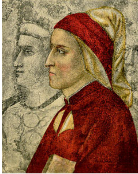
Portrait of Dante (1265-1321) by Giotto.