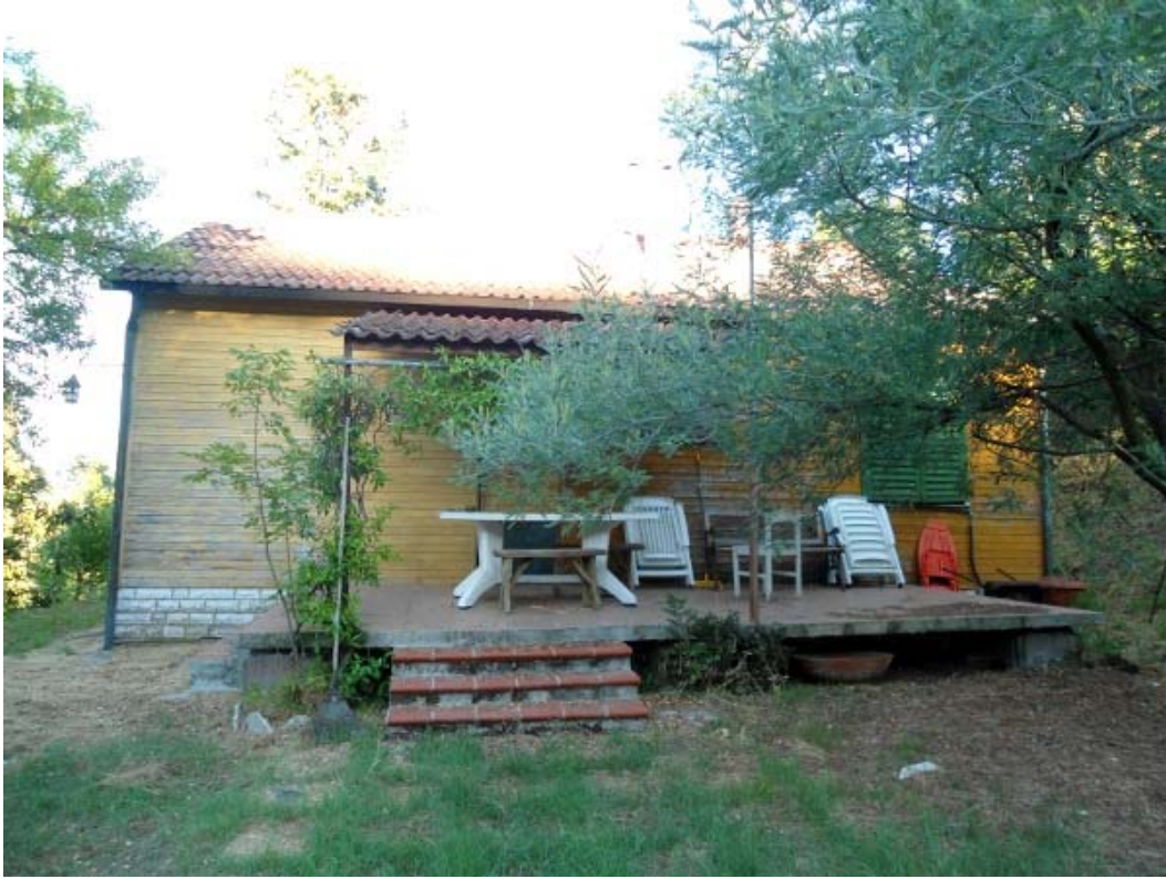
Farm of Parrana (near Pisa)