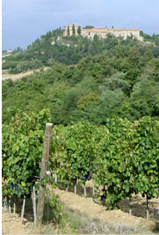
Porrona Castle and Middle Age town