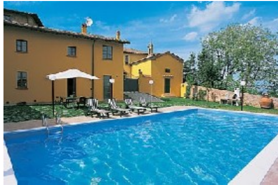
Farm of Arena (forget the swimming pool; it did not exist in 1775).

Cardboard bound register (12x9x1 inches) of 102 papers.