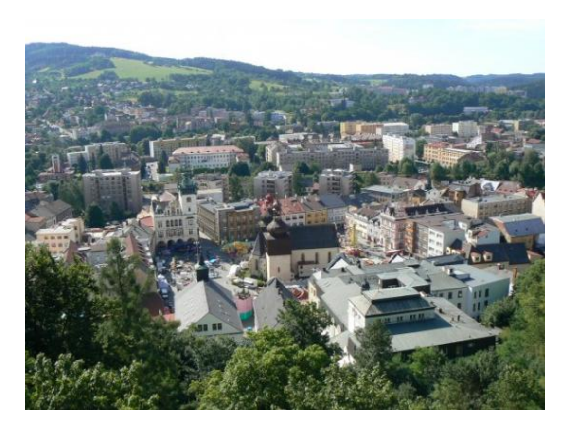
Downtown Nachod seen from the Castle of the Prince.