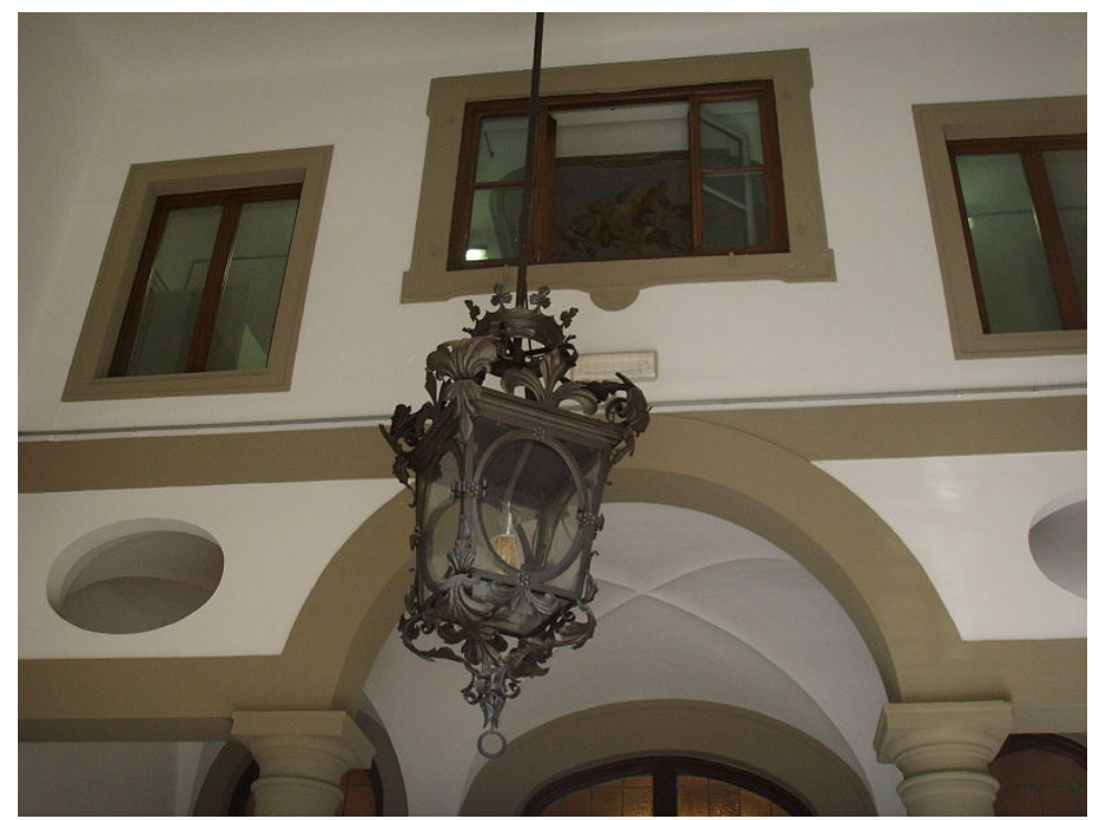
Entrance of the Nunziata Guadagni Palace –detail (crown of marchese on top of the lamp)