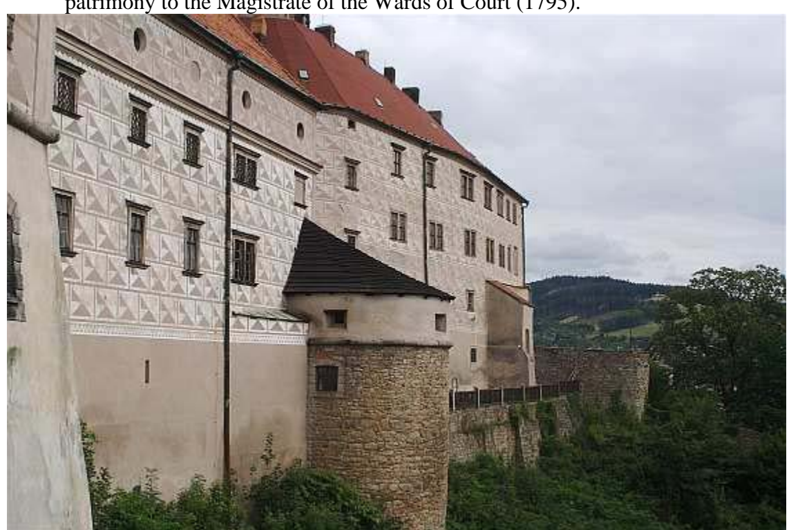
Castle of the Prince of Nachod