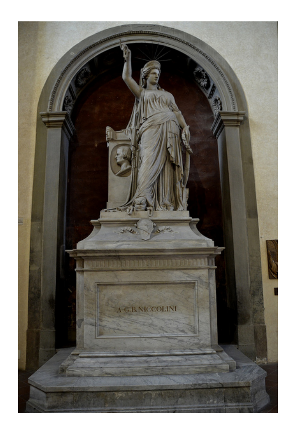
Niccolini by Spinazzi