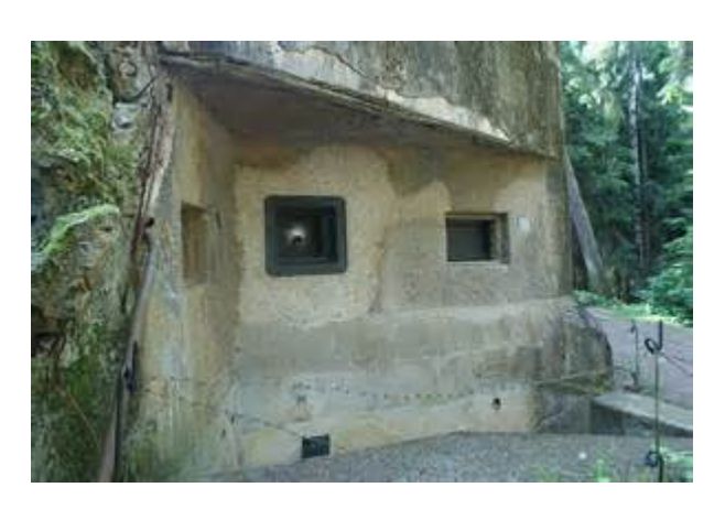
Bunker built by the Germans in WWII to defend Nachod from the Russians.

Series: Correspondence [210-222] 1763 – 1804 252 11 registers, 2 envelopes