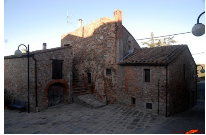
Montepescali: Piazza del Topo ("Square of the mouse")

5. Sale of the Estate of Montepescali [to the Corsi Family], 1780