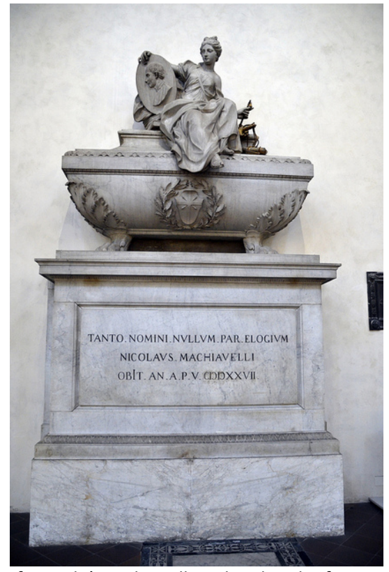
Spinazzi's tomb of Niccolo' Machiavelli in the Church of Santa Croce, Florence.