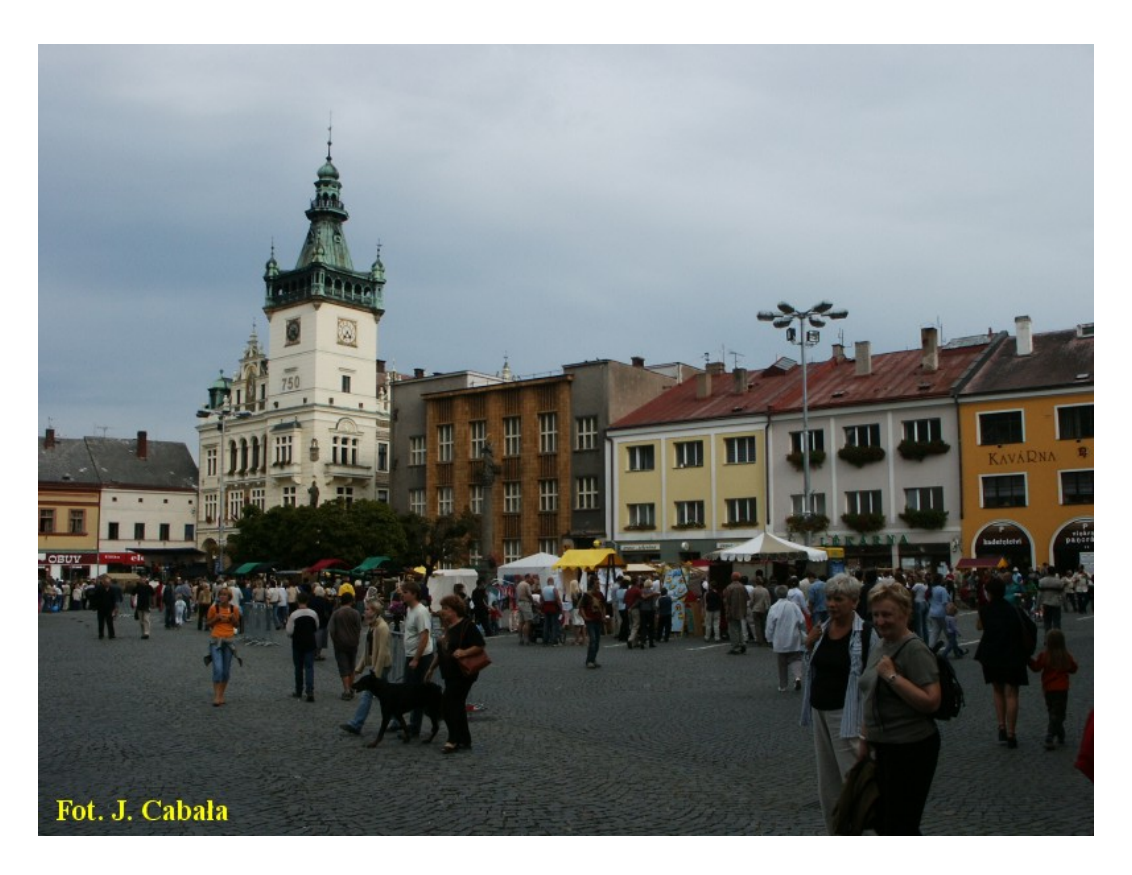
Principality of Nachod – Main Square