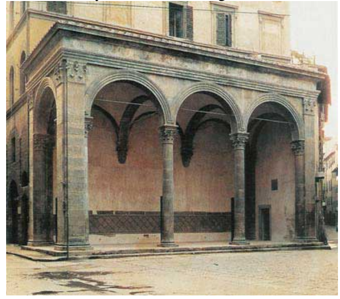
Della Vigna Street, Florence

6. Acquisition of a two story house in della Vigna Street in Florence, 1797