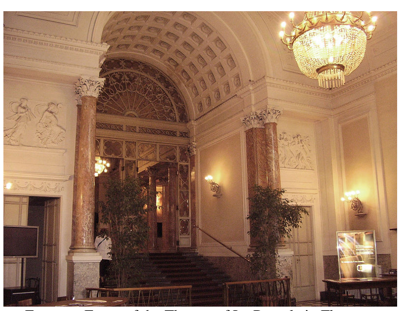
Entrance Foyer of the Theatre of La Pergola in Florence