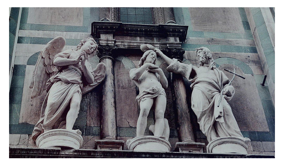
Baptism of Christ from below