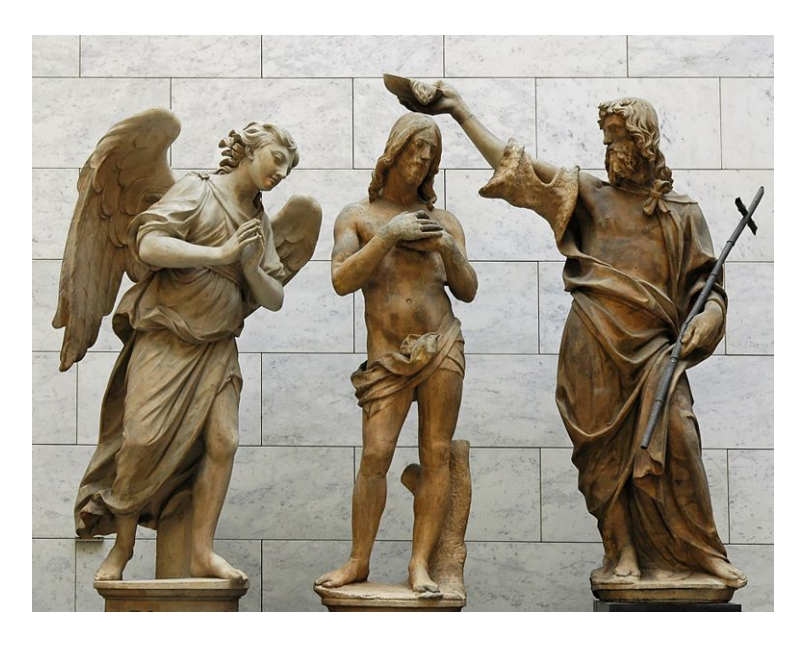
Baptism of Christ: Spinazzi sculpted the angel on the left.