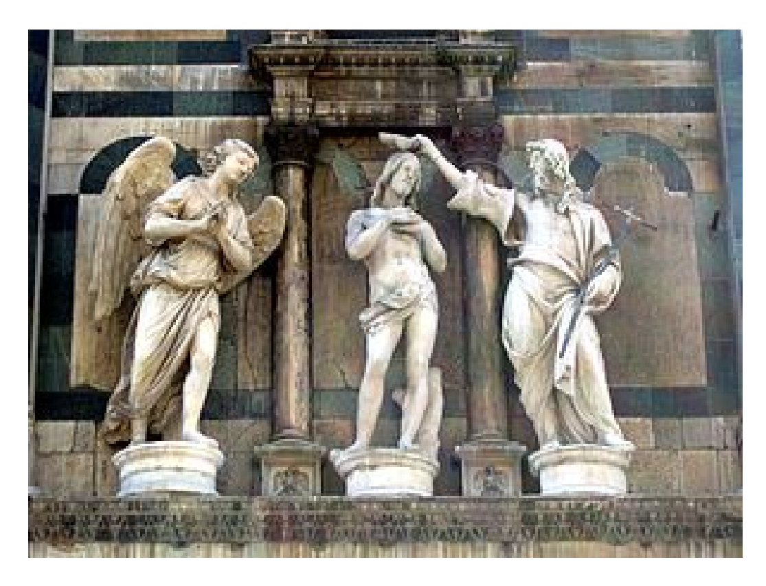
Enlargement of the Baptism of Christ on the Baptistery on the left