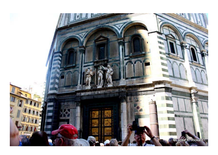
The Baptism of Christ, on the wall of the Baptistery of Florence (next to the "Duomo"). Spinazzi added the angel on the left to the original statue by Sansovino and Danti.