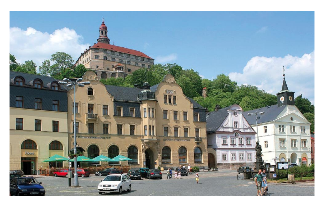
Square of Nachod with the castle of the Prince on top