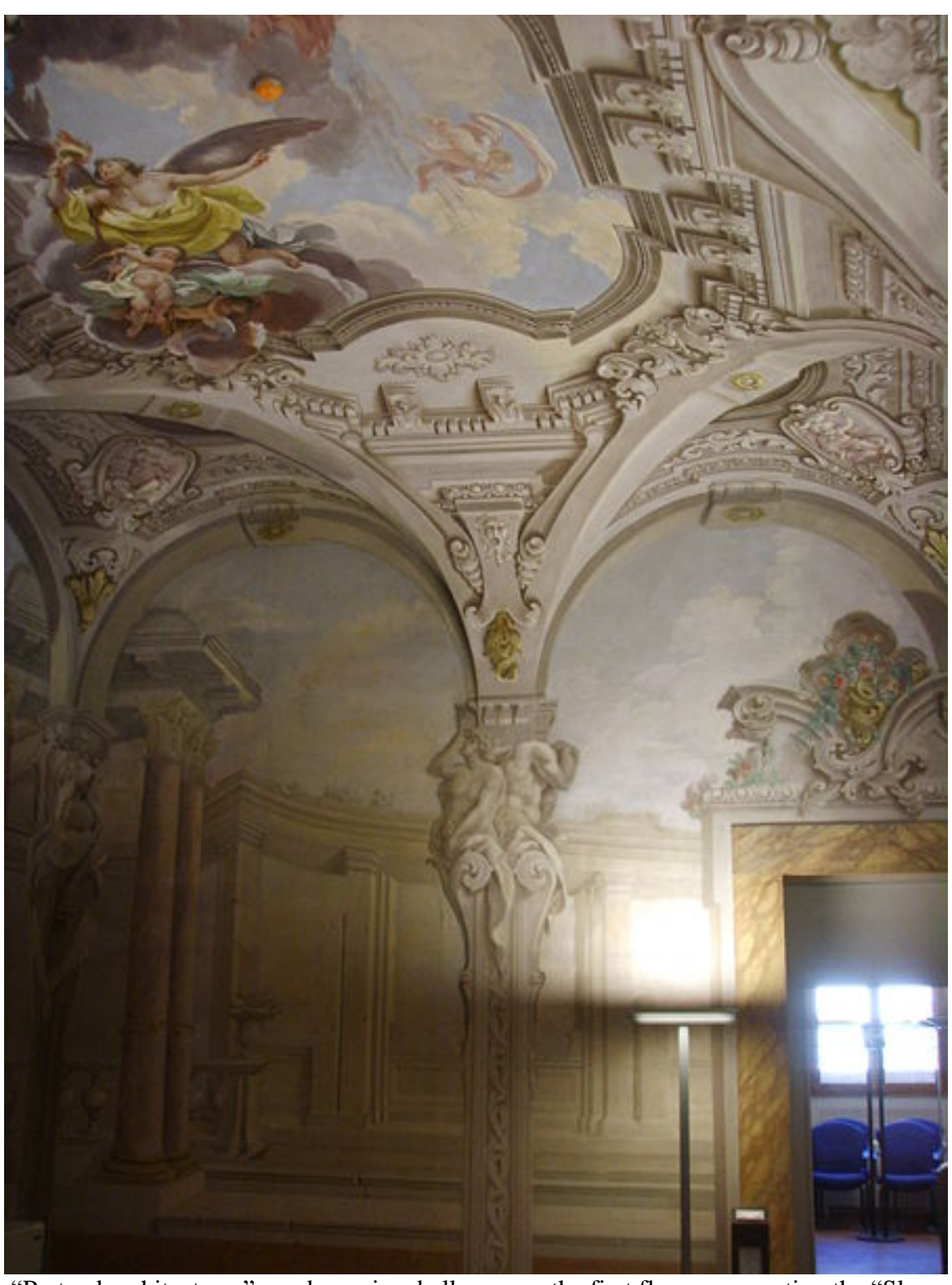
"Pretend architectures" are drawn in a ballroom on the first floor representing the "Sleep of Endimione" by artists Anton Domenico or Pietro Giarre' (Late 18th Century).