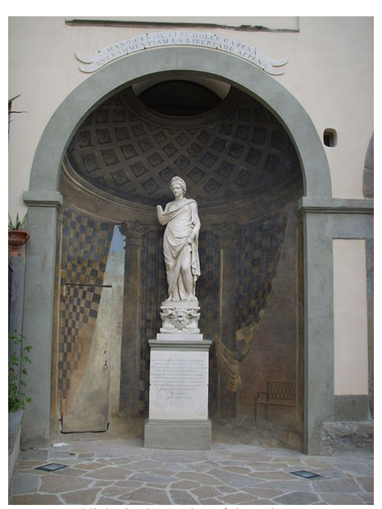
Niche in the garden of the palace.