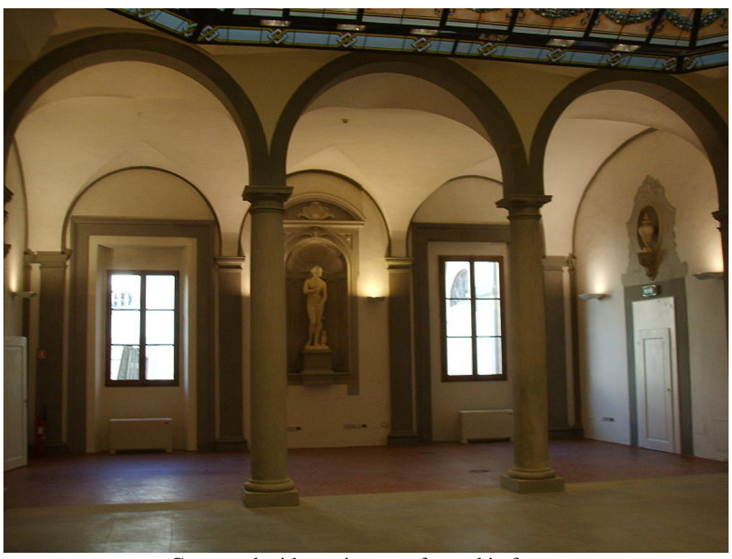
Courtyard with portico transformed in foyer.