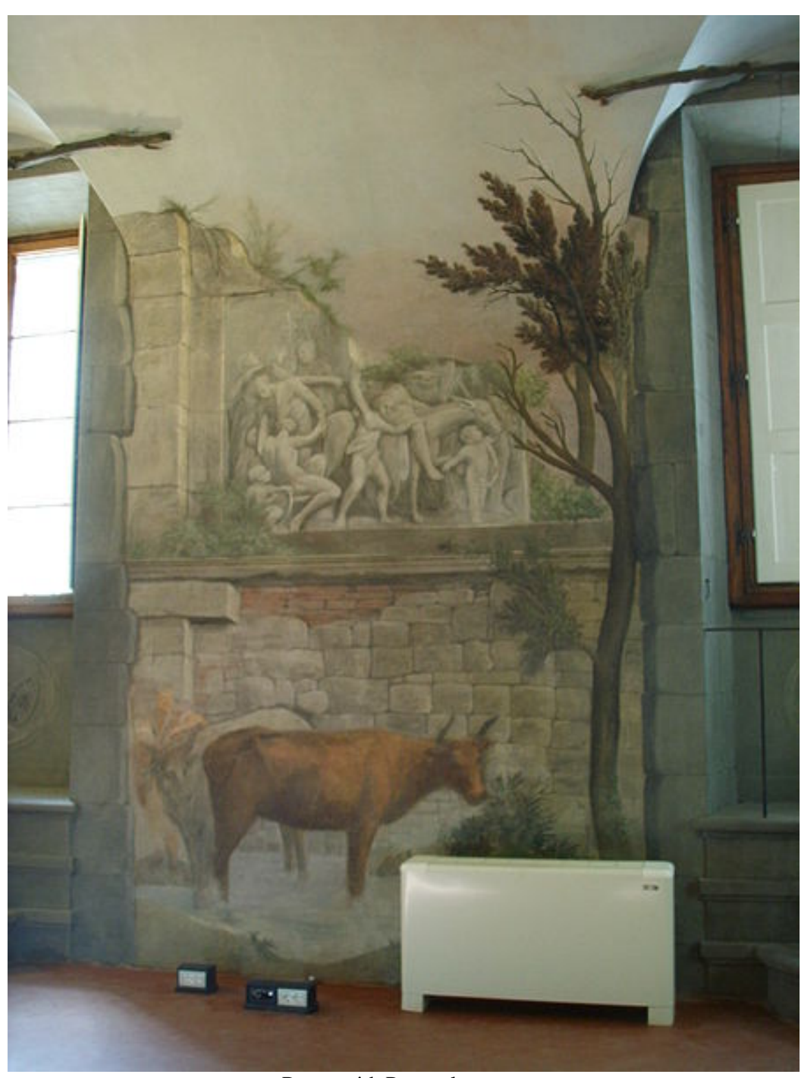
Room with Pastoral scenes.