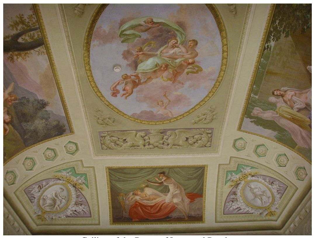
Ceiling of the Room of Love and Psyche