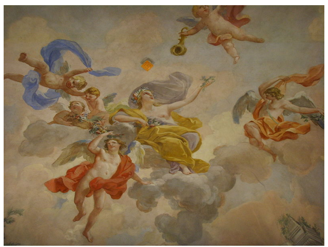
Ceiling of the Room with Ruins