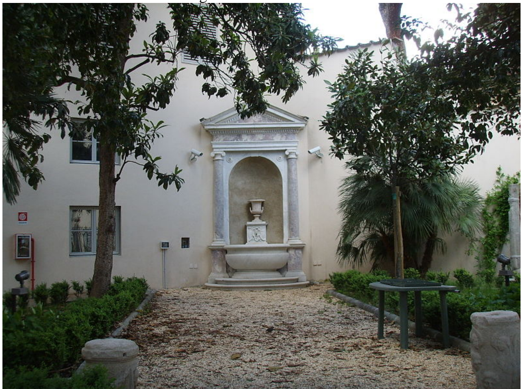
The small garden