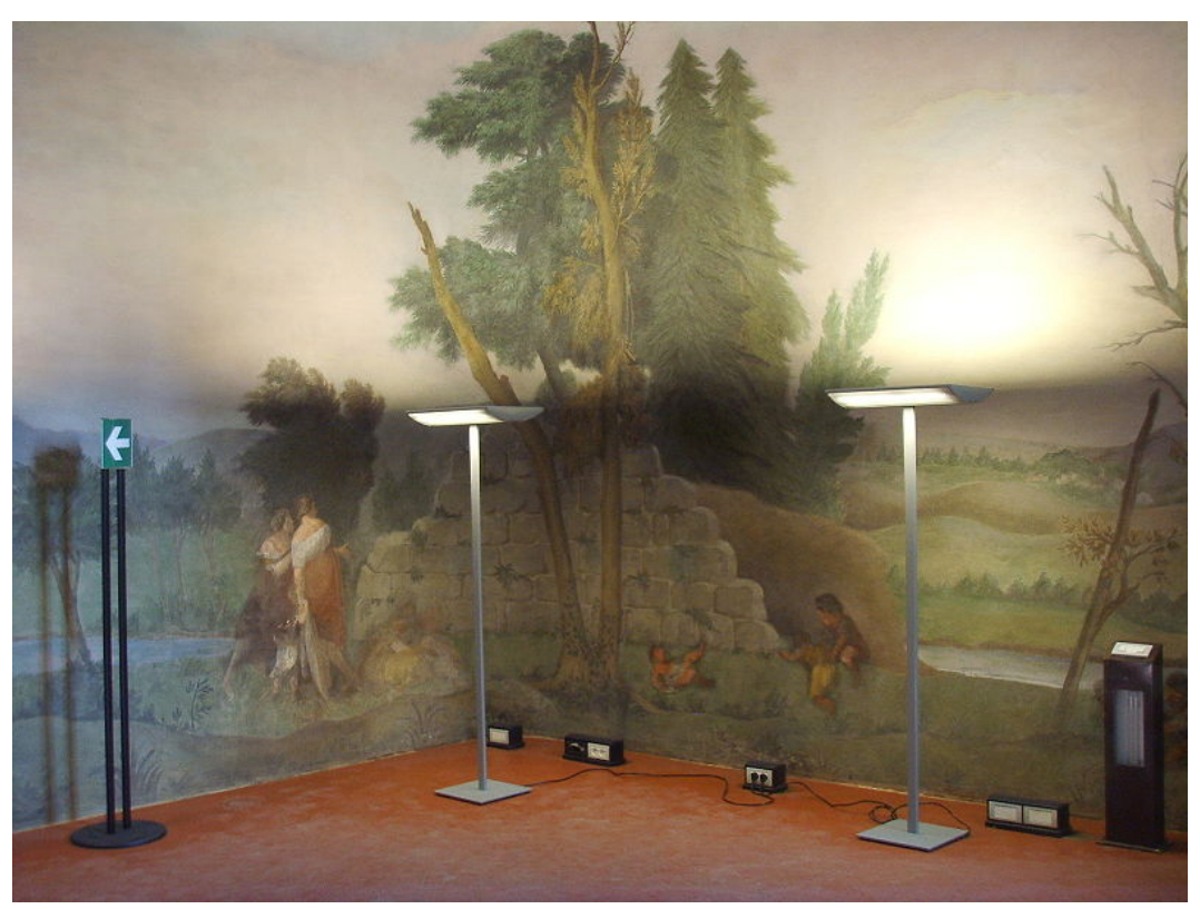
Room by artist Niccolo' Contestabile.