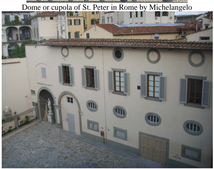
The inside courtyard of the Guadagni Palace.