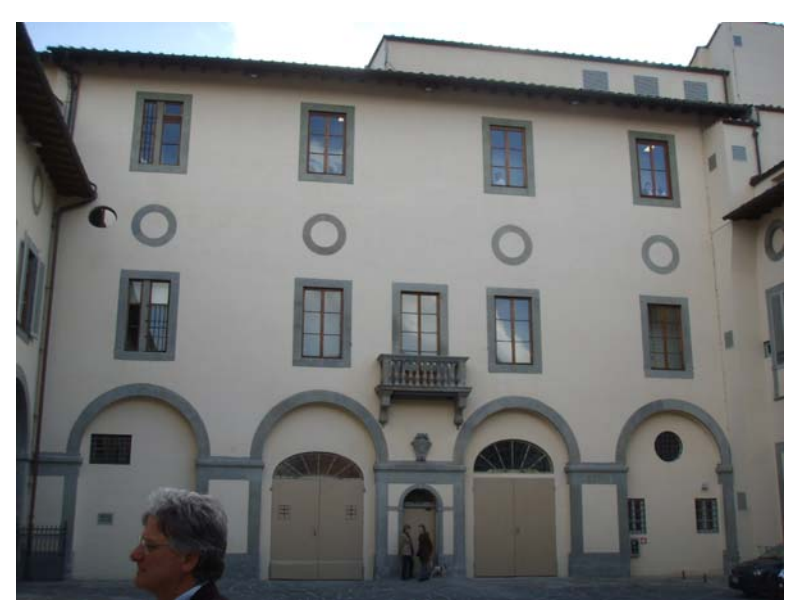
The stables on the ground floor. You can see the size of the Guadagni Palace by the size of the two women under the family crest.