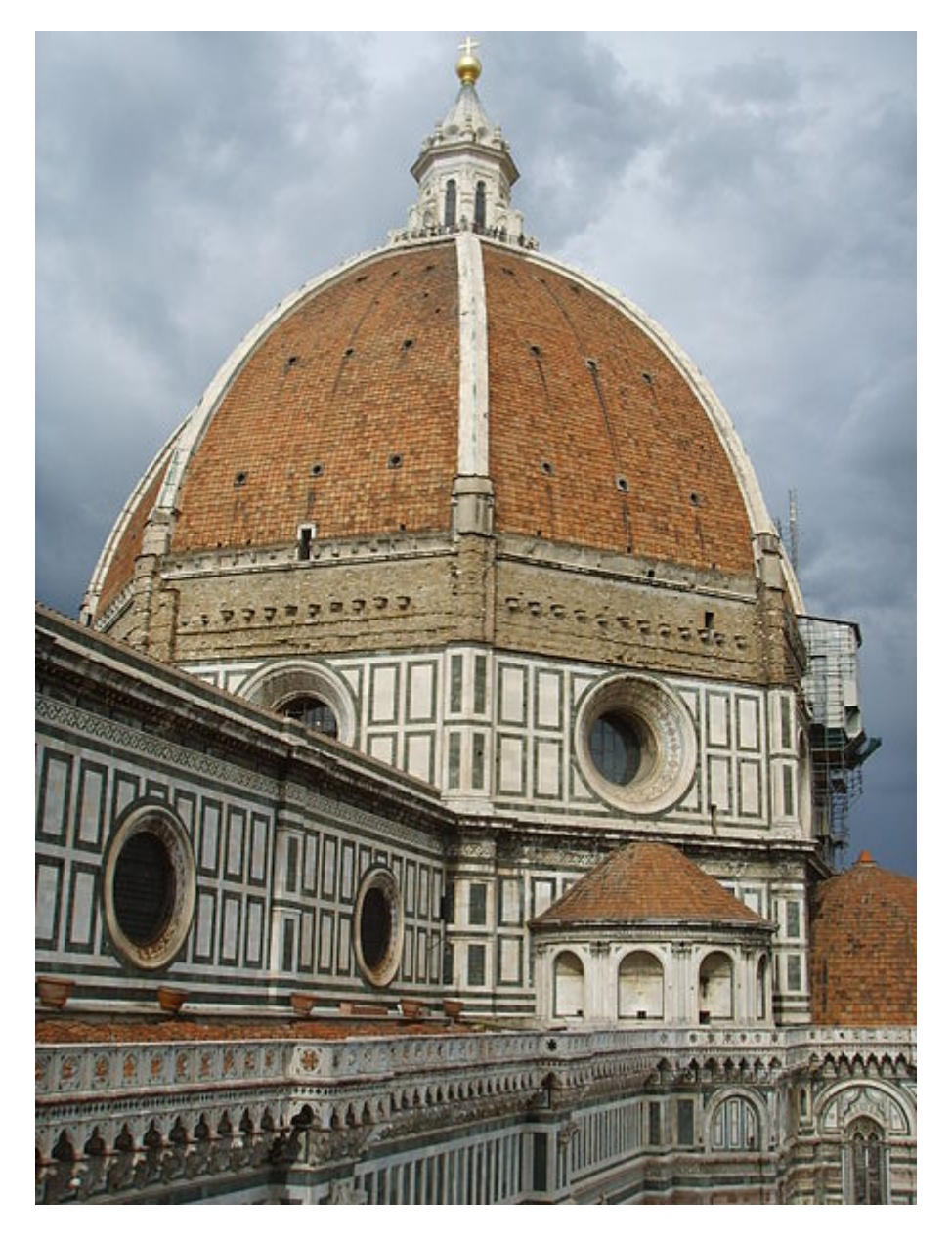
Dome (or "cupola") of the Cathedral of Florence by Brunelleschi. In front of the main door of the Guadagni Palace, a white marble plate shows the exact spot where the big ball on top of the Duomo came and fell with a crash on January 17, 1600.

You can see the Guadagni Family Crest sculpted in gray stone above the central window.